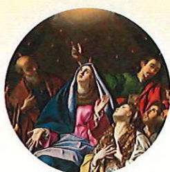
Solemnity of Pentecost 5/24

As Catholics, we celebrate the Easter Season from Easter Sunday through Pentecost. This year, the Easter Season is marked by three solemnities and two feasts. We also observe the month of Mary in May. Learn more about these great feasts and ways to celebrate all Easter season at archseattle.org/easter .