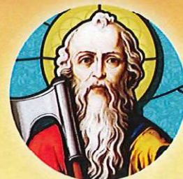
Feast of Saint Matthias 5/14