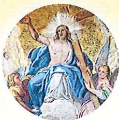
Solemnity of the Ascension 5/17