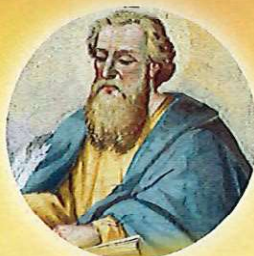
Feast of Saint Mark 4/25