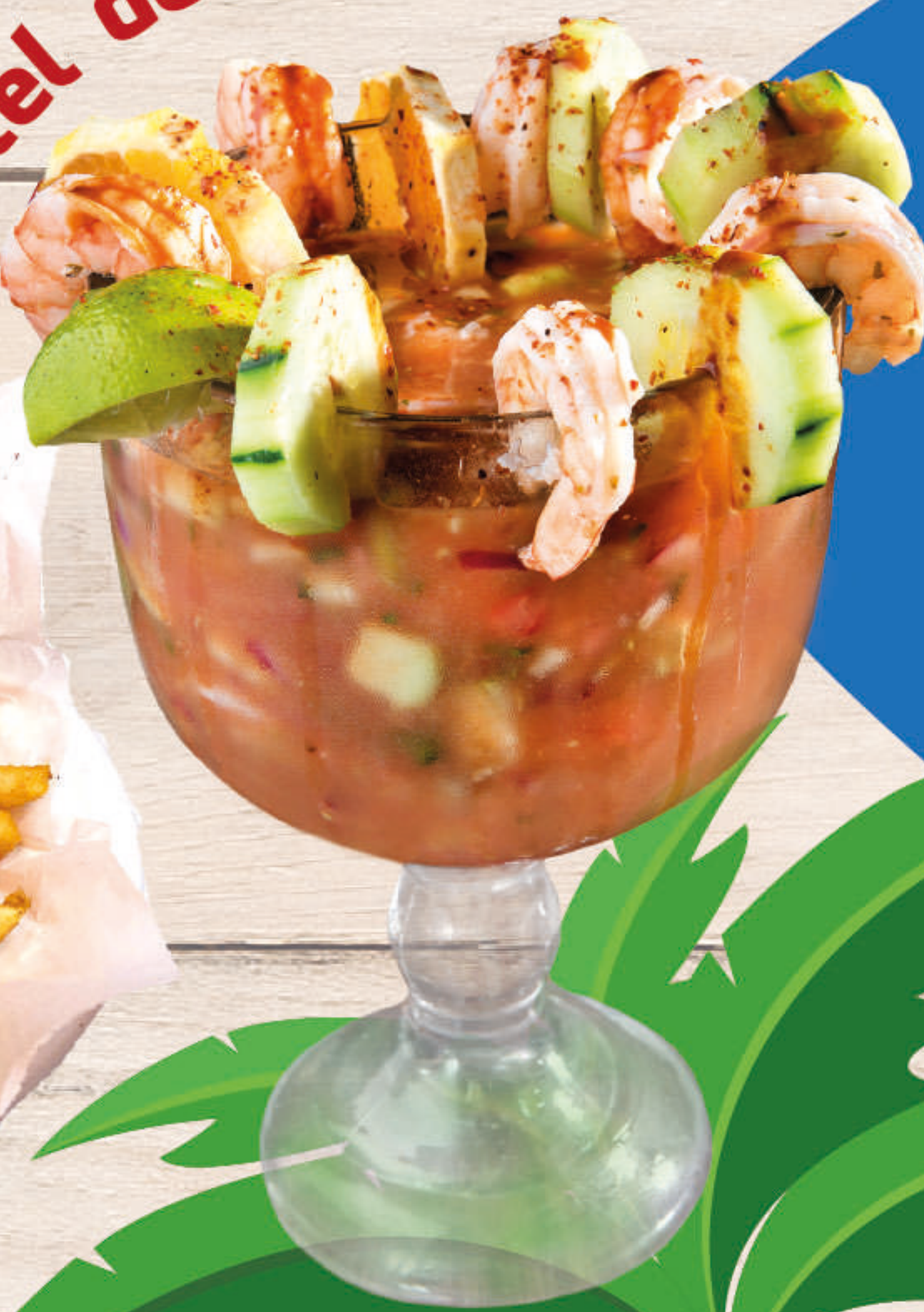
Cotxel de Camaron

Carne Asada, Pollo, Carnitas, Pastor, Birria, Jamon. Sandwich filled with mayonnaise, beans, cheese, lettuce, avocado, tomato, onions, and jalapeños. Served with fries.