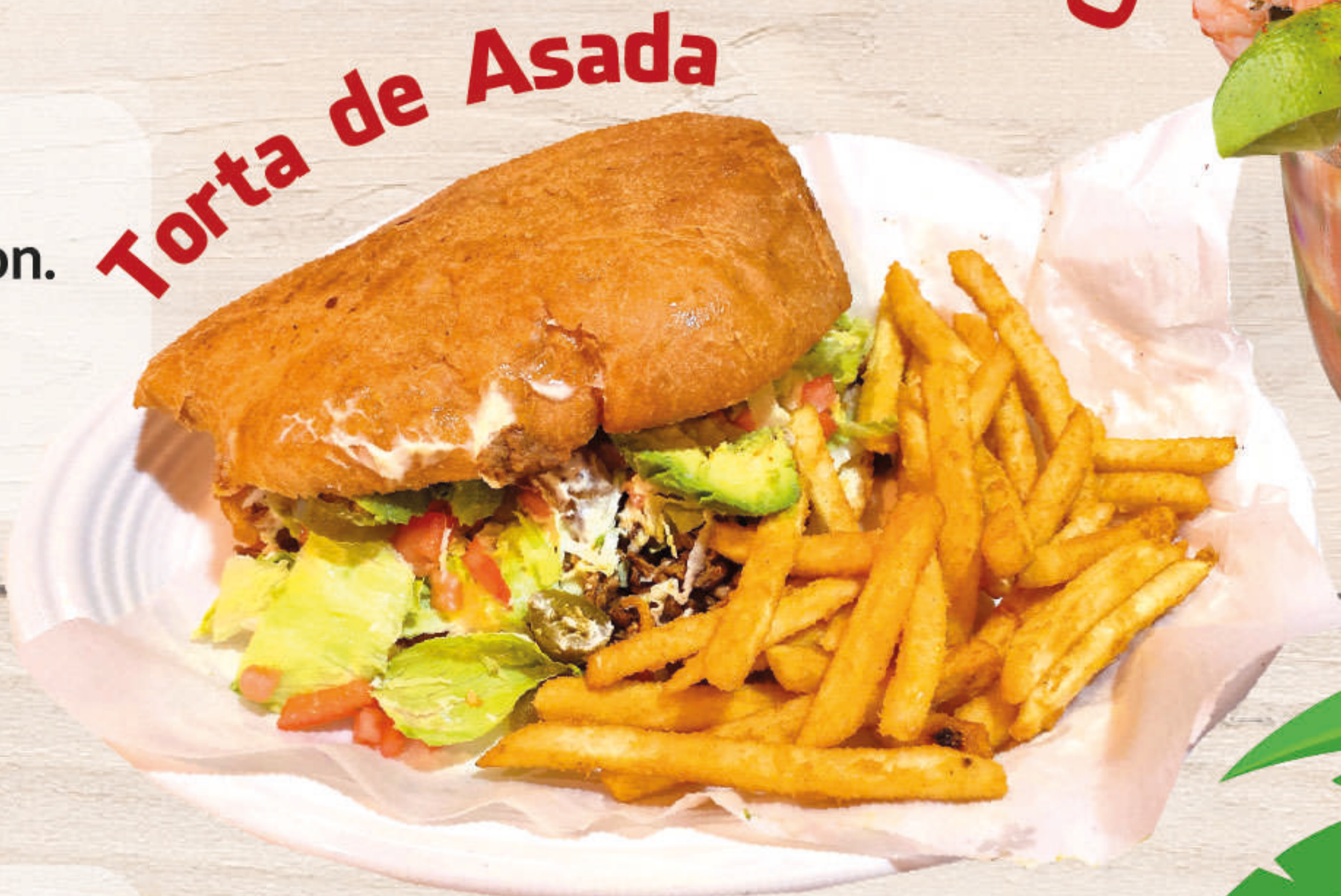
Torta de Asada

Carne Asada, Pollo, Carnitas, Pastor, Birria, Jamon. Sandwich filled with mayonnaise, beans, cheese, lettuce, avocado, tomato, onions, and jalapeños. Served with fries.