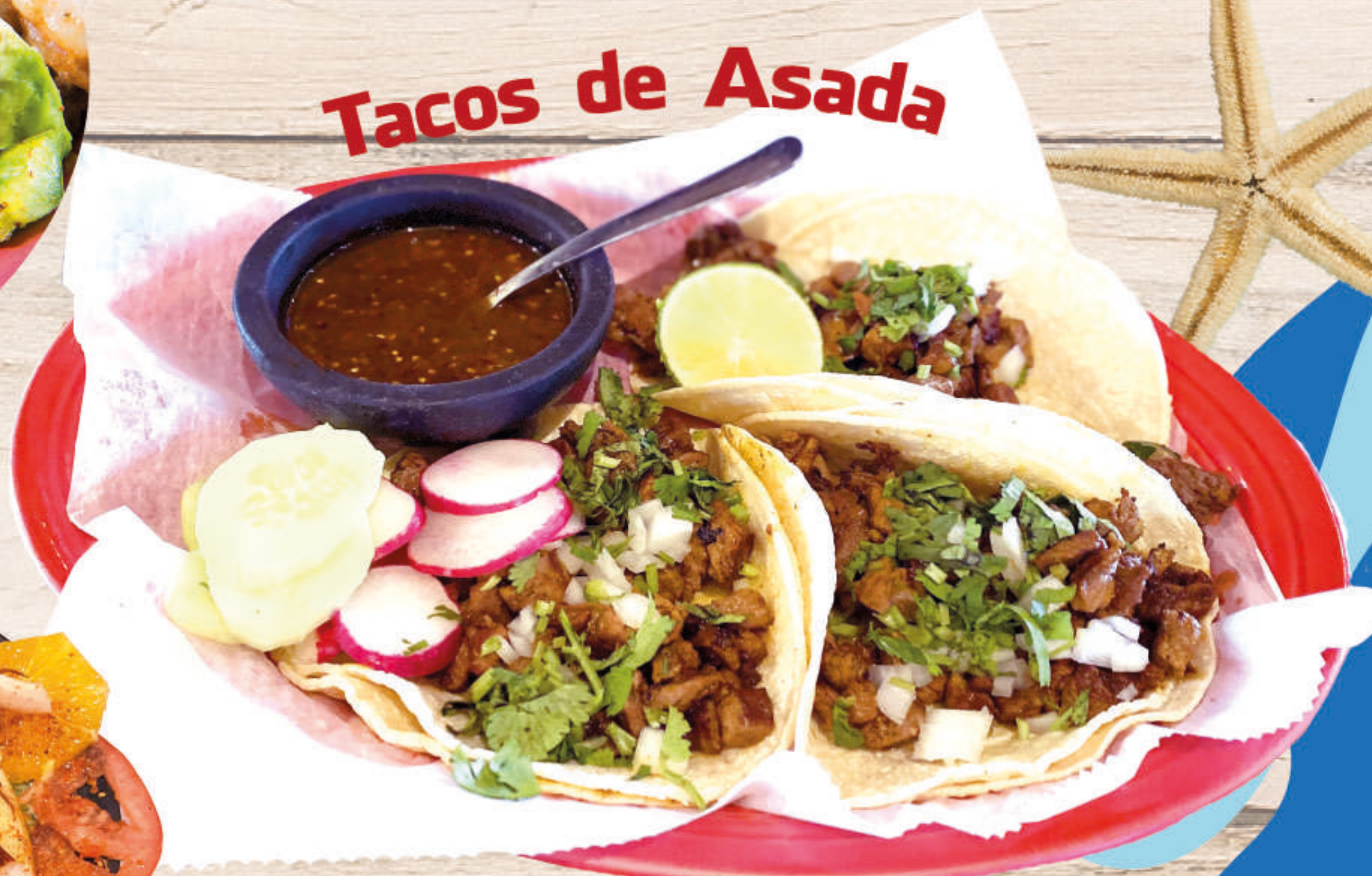
Tacos de Asada

Three tacos, topped with cabbage, pico de gallo, mango bites, and chipotle sauce. Served with rice and beans. No mix.