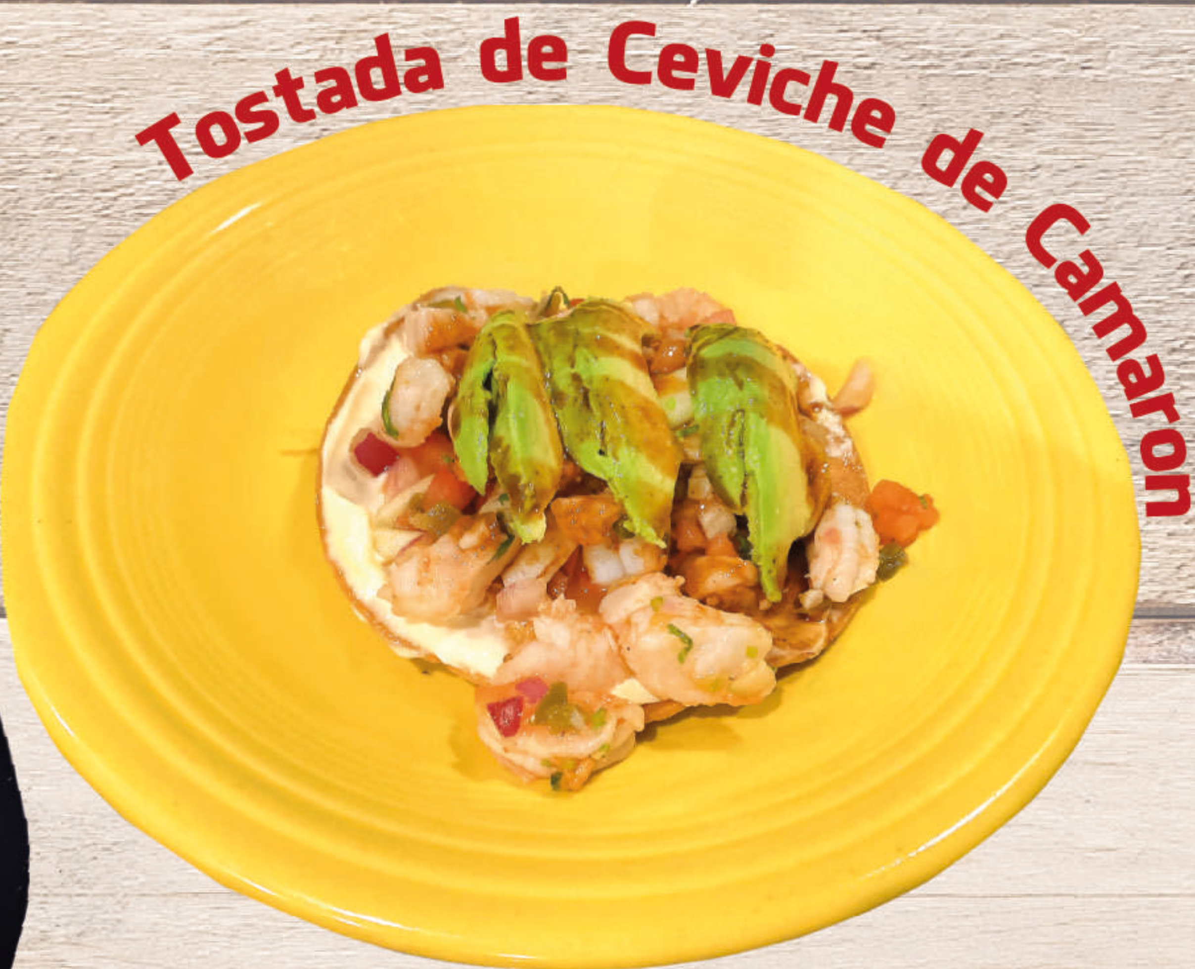
Tostada de Ceviche de Camaron

This item may be served undercooked. Consuming raw or uncooked foods such as meat, poultry, fish, shellfish, and eggs may increase your risk of food-borne illness. To our guests with food sensitivities or allergies: we cannot ensure that menu items do not contain ingredients that might cause an allergic reaction.