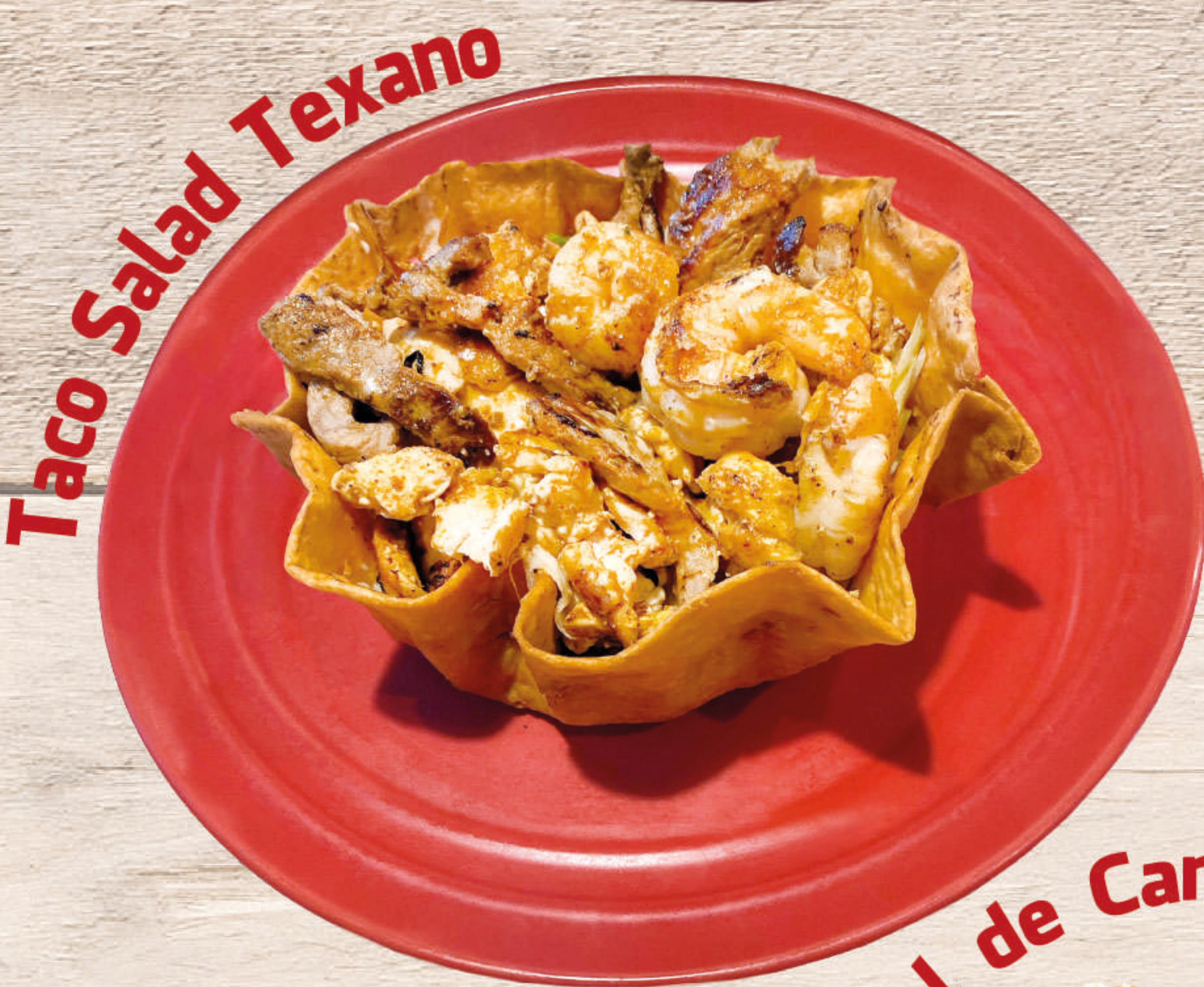
Taco Salad Texano