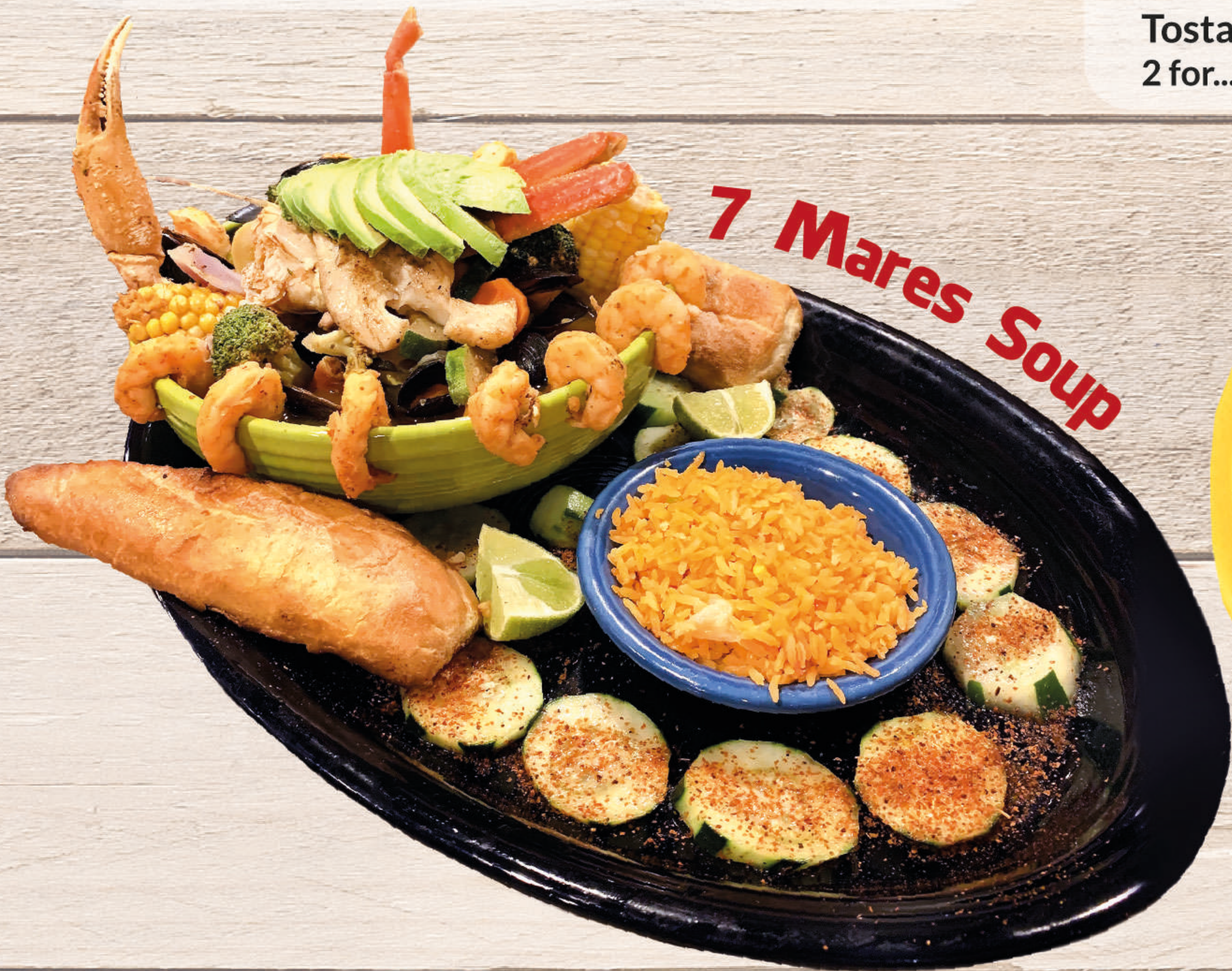
7 Mares Soup

Tostadas topped with ceviche with a layer of mayo underneath.