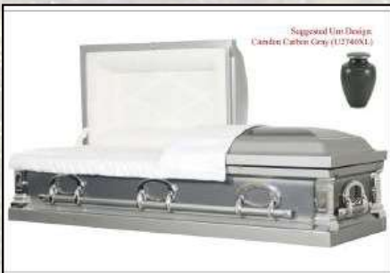
MEMORY SILVER & GRAPHITE CEREMONIAL Cremation Rental, Two Tone Silver & Graphite, White Chalet Crepe Interior $1,995