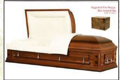
NORWOOD OAK Cremation Rental, Medium Brown Satin Finish, Rosentan Chalet Crepe Interior $2,095