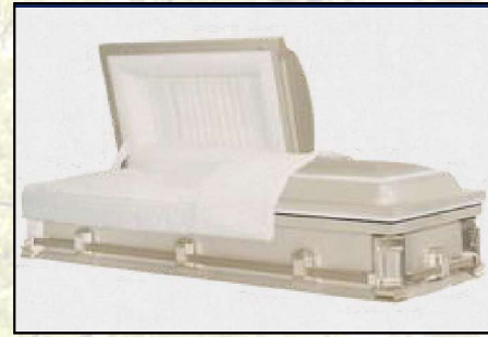
CAVALIER, 20 GAUGE Rosetan Crepe Interior $3,295