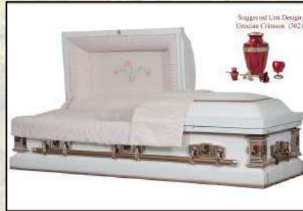
WHITE ROSE CEREMONIAL Cremation Rental, White Shaded Rose, Pink Chalet Crepe Interior $2,195