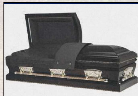
PATRIOT, 18 GAUGE Uniform Black Wool Interior $3,495