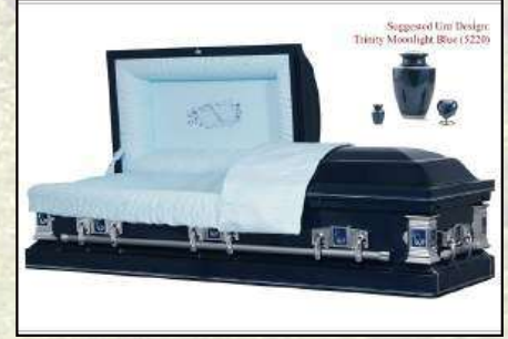
LORD'S PRAYER CEREMONIAL Cremation Rental, Dark Blue With Silver Pinstripe, Blue Chalet Crepe Interior $1,795