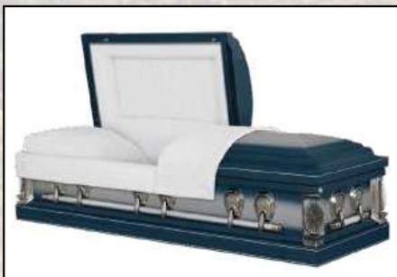
GALAXY STAINLESS STEEL Silver Velvet Interior $4,695