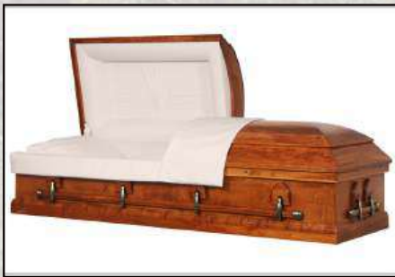
COLLINWOOD VENEER Rosetan Crepe Interior $3,195