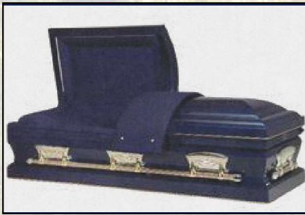
FREEDOM, 18 GAUGE Uniform Blue Wool Interior $3,495