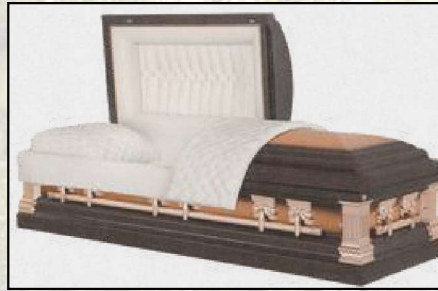
LINCOLN COPPER, 32 OZ. Almond Velvet Interior $6,695