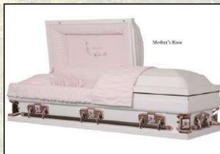
OLYMPIC WHITE & PINK 27, 20 GAUGE Pink Crepe Interior $3,495