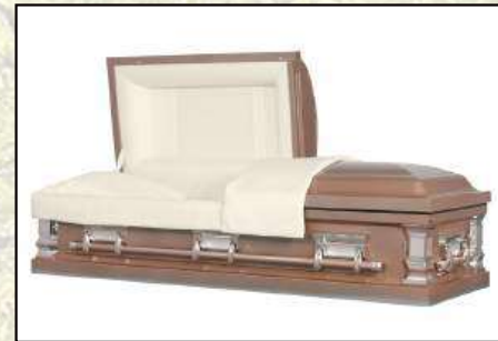
HIGHLAND COPPER, 20 GAUGE Rosetan Crepe Interior $3,095