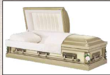
KENSINGTON STAINLESS STEEL Champagne Velvet Interior $4,695