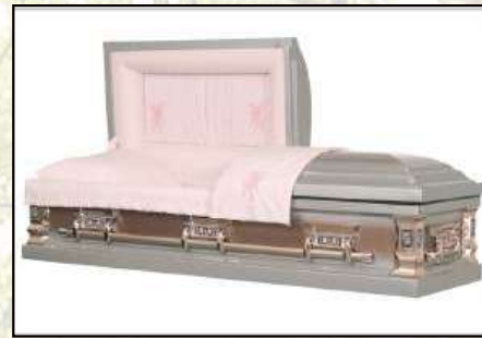
TAPESTRY ROSE, STAINLESS STEEL Pink Velvet Interior $4,495