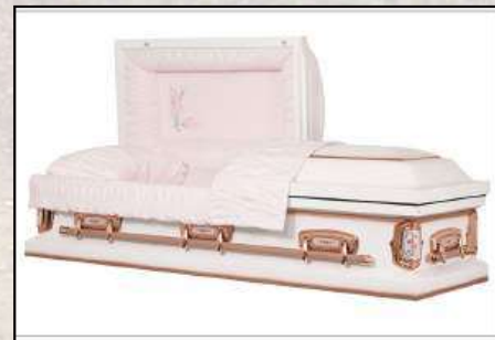
CARNATION, 20 GAUGE Pink Crepe Interior $2,895