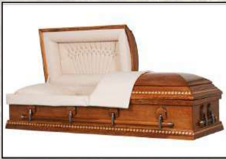
TACOMA POPLAR Rosetan Basketweave Interior $3,795