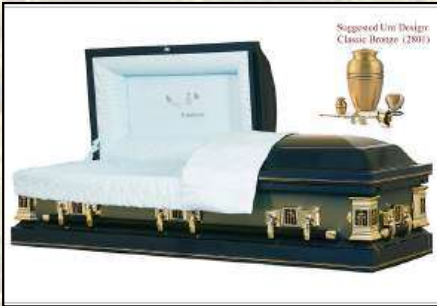
IN GOD'S CARE CEREMONIAL Cremation Rental, Gold Burnishing Dark Blue Rails, Blue Chalet Crepe Interior $2,395