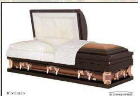
RIDGEFIELD, 18 GAUGE Rosetan Crepe Interior $3,895