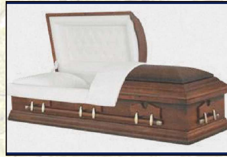
FREDERICK SOLID POPLAR Ivory Basketweave Interior $3,795