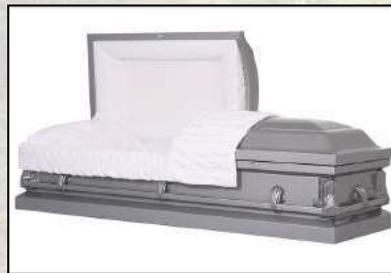
WINSTON SILVER, 20 GAUGE NON-GASKETED White Crepe Interior $1,595