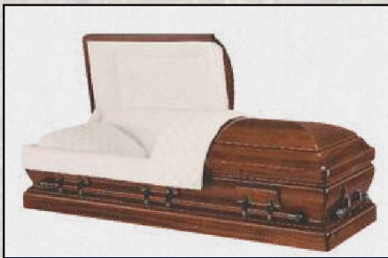
OLYMPUS MAHOGANY Ivory Velvet Interior $7,395