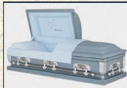
LAKESHORE, 18 GAUGE Blue Crepe Interior $3,895