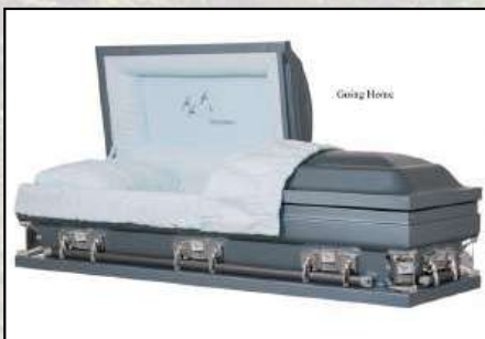
OLYMPIC BLUE 27, 20 GAUGE Blue Crepe Interior $3,495