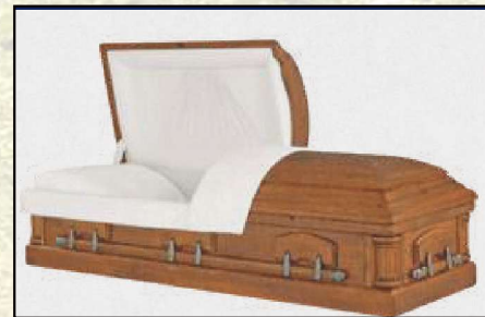
CONSTANTINE CHERRY Almond Velvet Interior $6,895