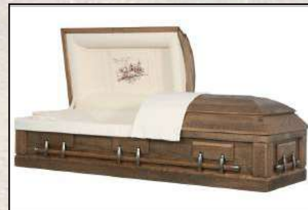
BARNWOOD OAK Natural Cotton Interior $4,095