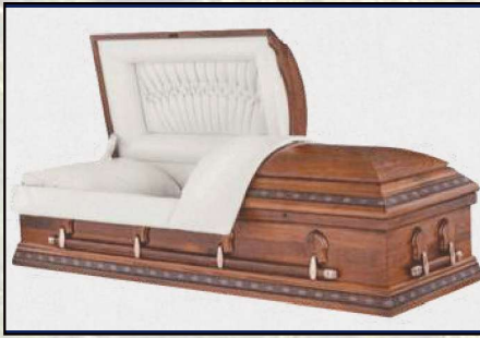
STUART SOLID POPLAR Arbutus Velvet Interior $3,895