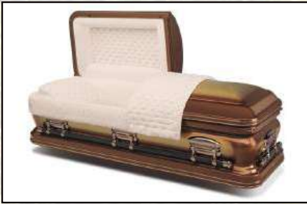
VENETIAN BRONZE, 48 OZ. BRONZE Premium Champagne Velvet Interior $9,595