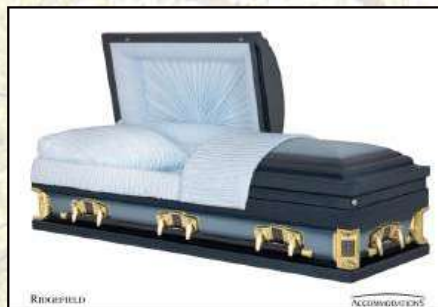
RIDGEFIELD, 18 GAUGE Blue Crepe Interior $3,895