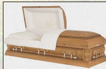
OAKWOOD OAK Rosetan Crepe Interior $4,495