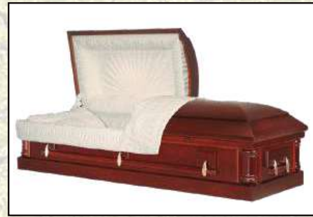
LINSAN POPLAR VENEER Rosetan Crepe Interior $3,295