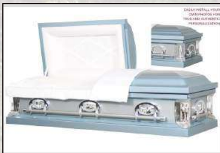
REMINISCE LIGHT BLUE, 20 GAUGE White Crepe Interior $2,995