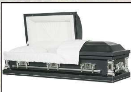
ASCENT METALLIC GRAPHITE, 20 GAUGE White Crepe Interior $2,995