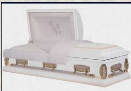
CORAL MIST, 18 GAUGE Pink Crepe Interior $3,495