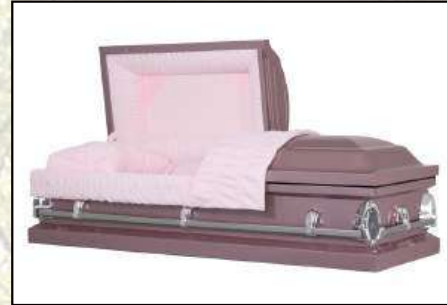
HARTLEY ORCHID, 20 GAUGE Pink Crepe Interior $2,495