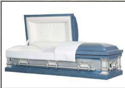
MOONLIT CASCADE AND SILVER, 20 GAUGE White Crepe Interior $3,095