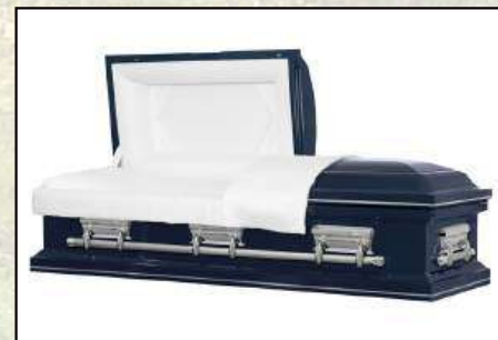
TIMELESS DARK BLUE, 20 GAUGE White Crepe Interior $2,995