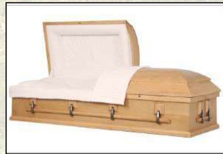
SANDWOOD VENEER Rosetan Crepe Interior $2,595