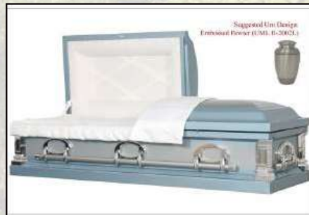
MEMORY LIGHT BLUE CEREMONIAL Cremation Rental, Two Tone Silver & Light Blue, White Chalet Crepe Interior $1,995