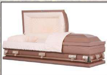
REED COPPER 29, 20 GAUGE NON-GASKET Rosetan Crepe Interior $3,195