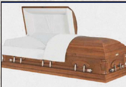
SOVEREIGN PECAN Ivory Velvet Interior $4,395