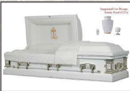
GOLDEN CROSS CEREMONIAL Cremation Rental, White With Gold Pinstripe, White Chalet Crepe Interior $1,595