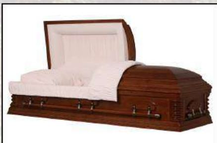
ALLEGHANY CHERRY Rosetan Velvet Interior $6,695