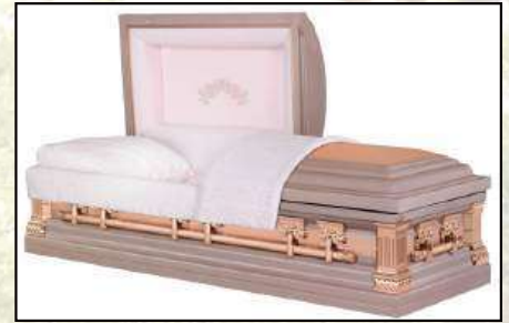
LINCOLN COPPER, 32 OZ. Pink Velvet Interior $6,695