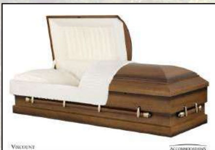
VISCOUNT POPLAR Rosetan Crepe Interior $3,795