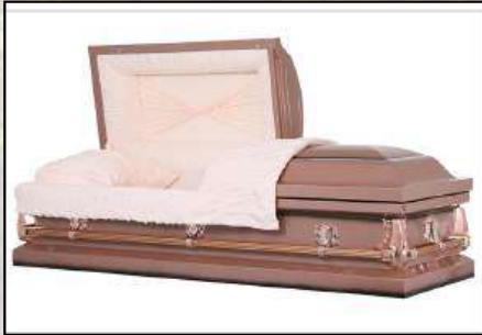
TREEMONT COPPER, 20 GAUGE Rosetan Crepe Interior $2,595