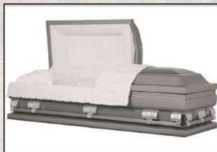
REED SILVER 29, 20 GAUGE NON-GASKET White Crepe Interior $3,195