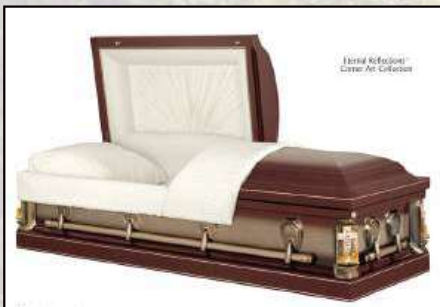
MARQUETTE, 18 GAUGE Arbutus Velvet Interior $4,395