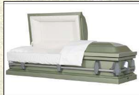
COLESVILLE SEAMIST, 20 GAUGE Eggshell Crepe Interior $2,095