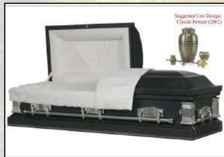
ASCENT GRAPHITE CEREMONIAL Cremation Rental, Metallic Graphite With Silver Pinstripe, White Chalet Crepe Interior $1,395