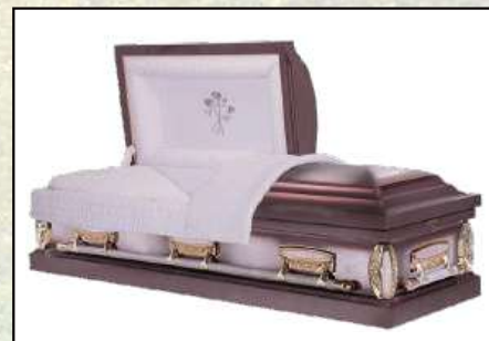
MEADOW MERLOT, 18 GAUGE Orchid Crepe Interior $3,595