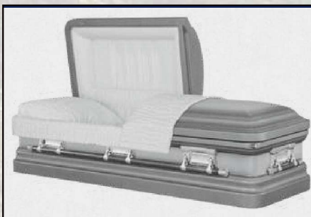
GEM STEEL, 18 GAUGE Silver Crepe Interior $3,795