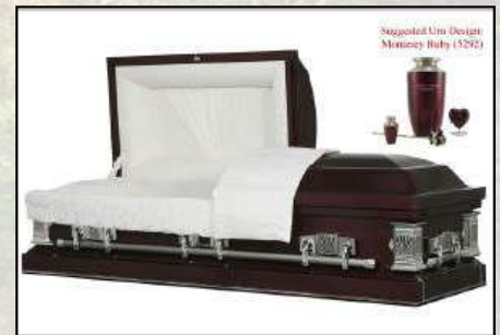
ASCENT BLUSH CEREMONIAL Cremation Rental, Metallic Blush With Silver Pinstripe, White Chalet Crepe Interior $1,395