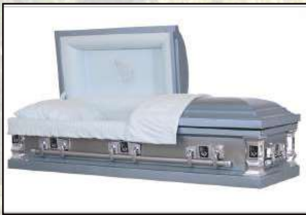
BLUE MIST, STAINLESS STEEL Light Blue Velvet Interior $4,495