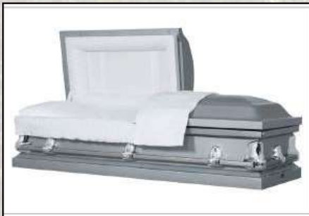
SIERRA SILVER, 20 GAUGE White Crepe Interior $2,295