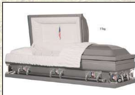
OLYMPIC SILVER 27, 20 GAUGE White Crepe Interior $3,495