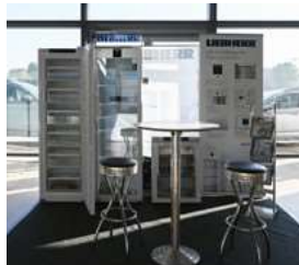
3 meters without tables