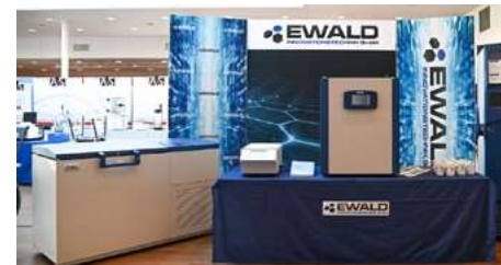
5 meters without tables