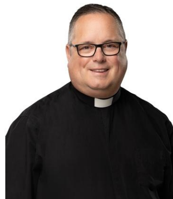
Pastor, St. Anne Catholic Church