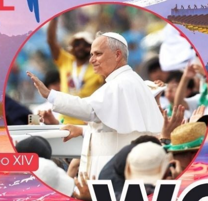
Pope Leo XIV

Packages from $5499 Includes roundtrip airfare from PBI, 4-star hotel, meals and more!