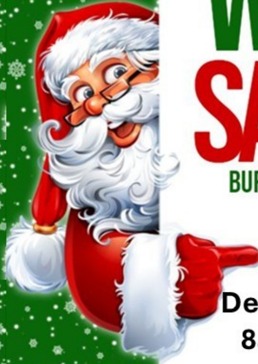
Photo with Santa