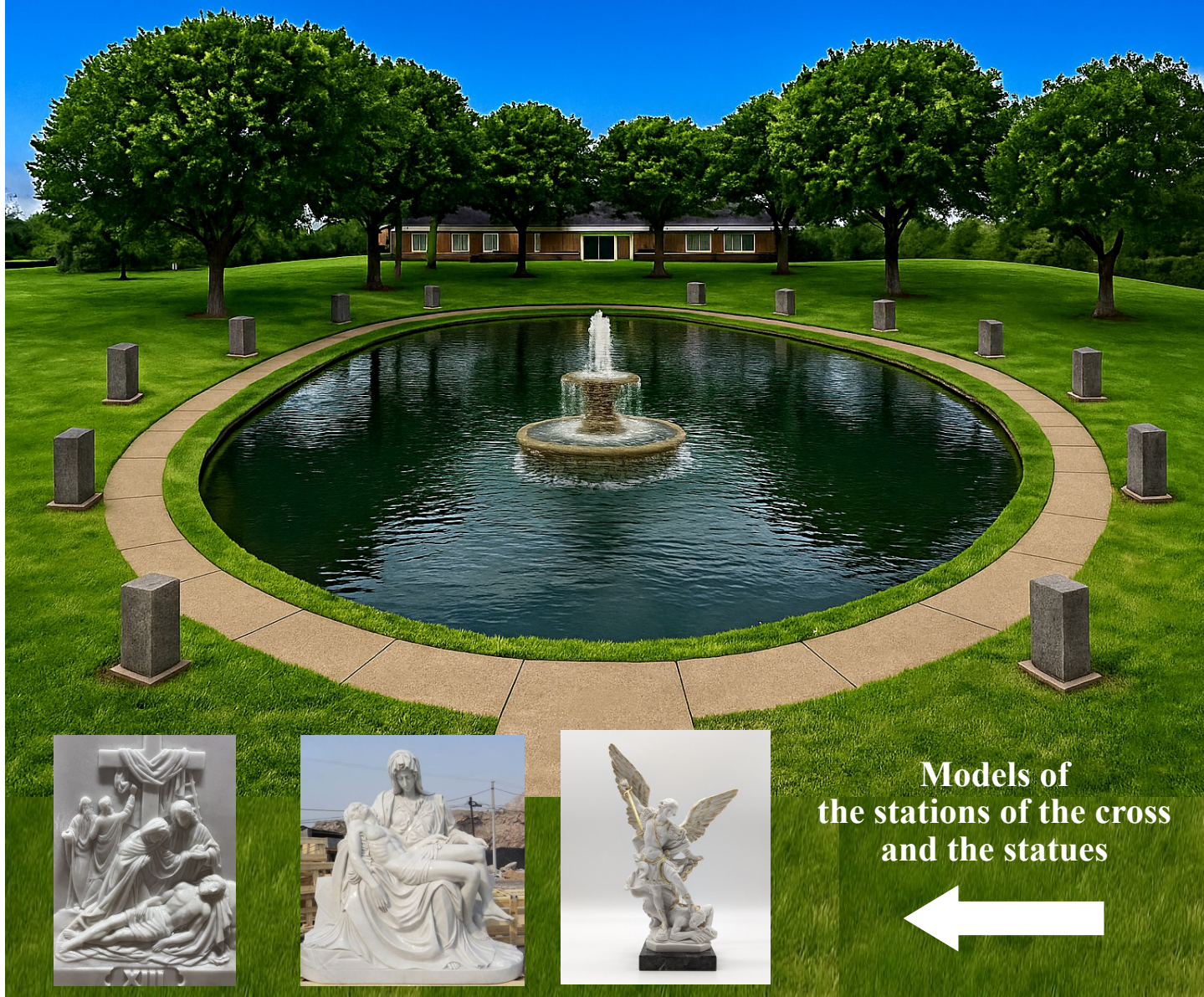
Models of the stations of the cross and the statues

If you are interested in sponsoring one of the stations or statues please call the parish office. Thank you for being part of this project.