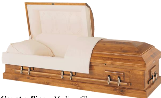
Country Pine – Medium Gloss Country Pine Finish Tailored Cotton Interior - $4,195