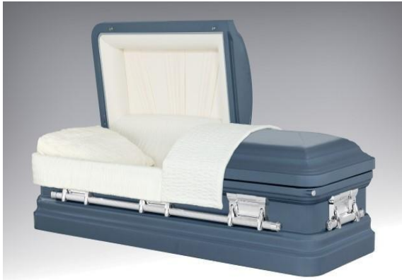
Springfield - 18ga. Steel, 4 colors available Brushed Natural 1 pt. / London Blue Finish Cashmere Velvet Interior - $3,795