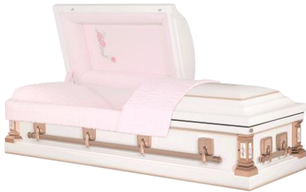
Sterling - 18ga. Steel Antique White Silver Rose / Ebony Platinum Pink Crepe / Silver Crepe Interior - $3,195