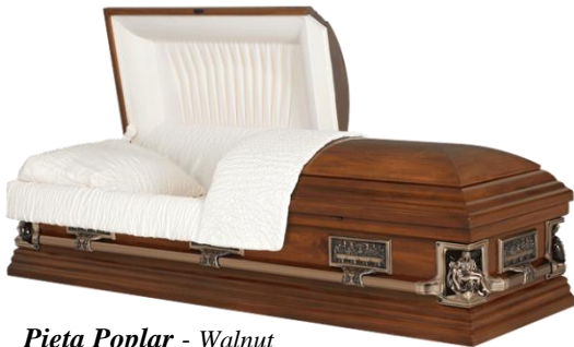
Pieta Poplar - Walnut Polished Finish Rosetan Crepe Interior - $4,395