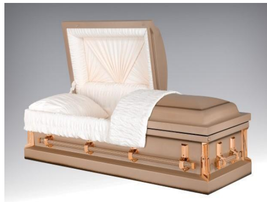
Mercury - 20ga Steel, 4 colors available Copper Venetian Bronze Finish Rosetan Crepe Interior - $2,695