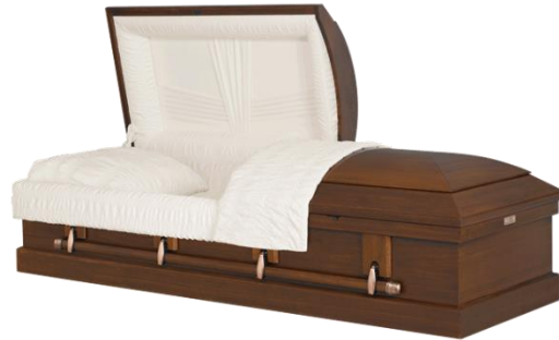
Whitmire II – Poplar Veneer Satin Dark Walnut Finish Rosetan Crepe Interior - $3,095