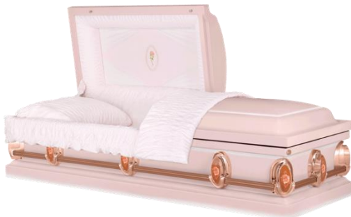
Misty Pink - 20ga. Steel Polished Pastel Pink/White Finish Pink Rose Crepe Interior, Pearls surround rose in panel - $2,995