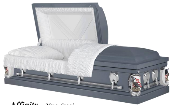
Affinity - 20ga. Steel London Blue Finish Silver Crepe Interior - $3,395