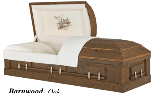
Barnwood- Oak Satin Timber Finish Natural Cotton Interior- $3,995