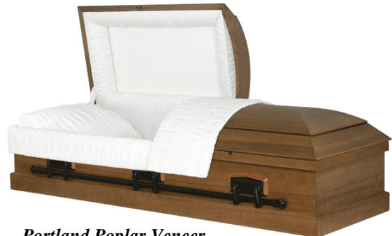
Portland Poplar Veneer Matte Smithville Finish Rosetan Crepe Interior - $3,195