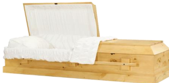
Frontier Pine – Flat Top Light Satin Interior - $2,795