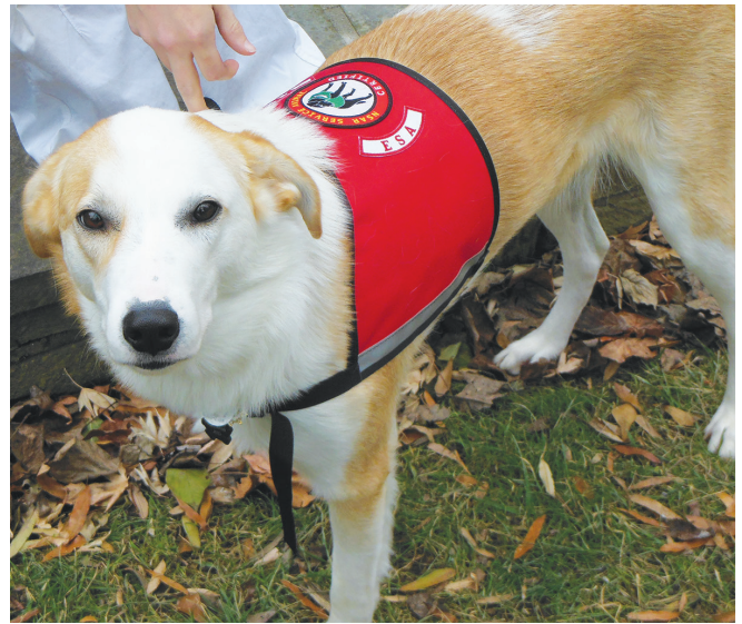
Nike in his new ESA vest.

MCHS rescue becomes certified Emotional Support Animal