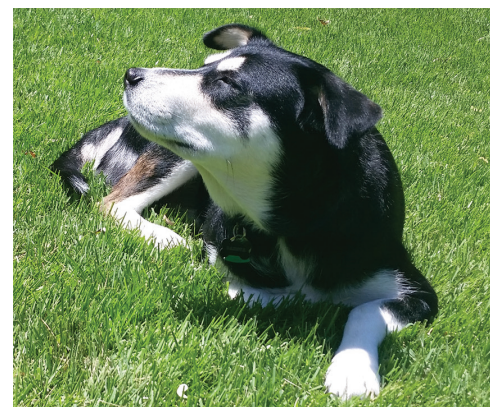
MCHS alumna, Dakota, enjoys new spring grass

MCHS can microchip your pet. Call us at (240) 252-2555 for more information.