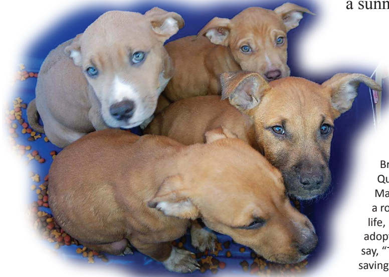
Brooklyn, Bronx, Queens and Manhattan had a rough start in life, but they are all adopted now. They say, "Thank you for saving us!"