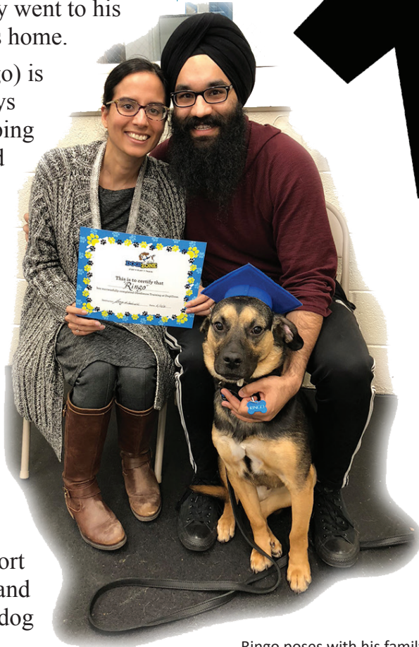
Ringo poses with his family on obedience class graduation day.