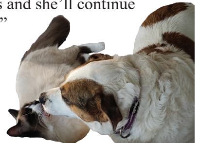
Flurry and Cobba snuggle

Flurry enjoys a favorite feathered wand toy. “She likes it so much that when I’m done playing with her, I can stick it in between the couch cushions and she’ll continue playing!”