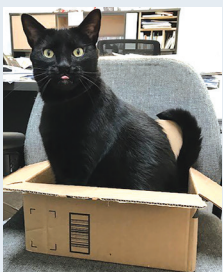
Shadow, my current office mate, sends his thanks for your support.