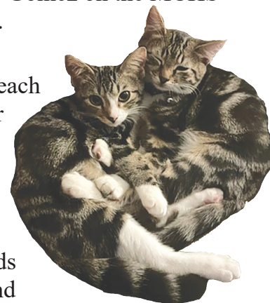
Gomez (left) snuggles with Morticia.