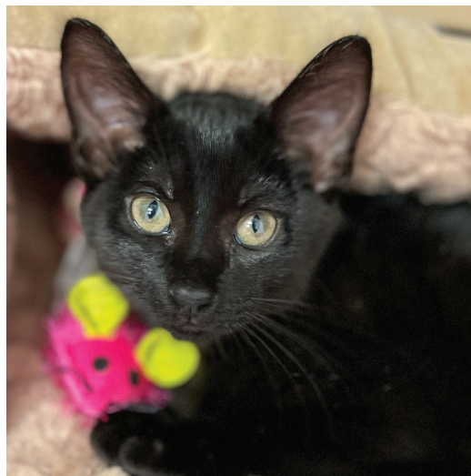
Manny loves his mouse toys