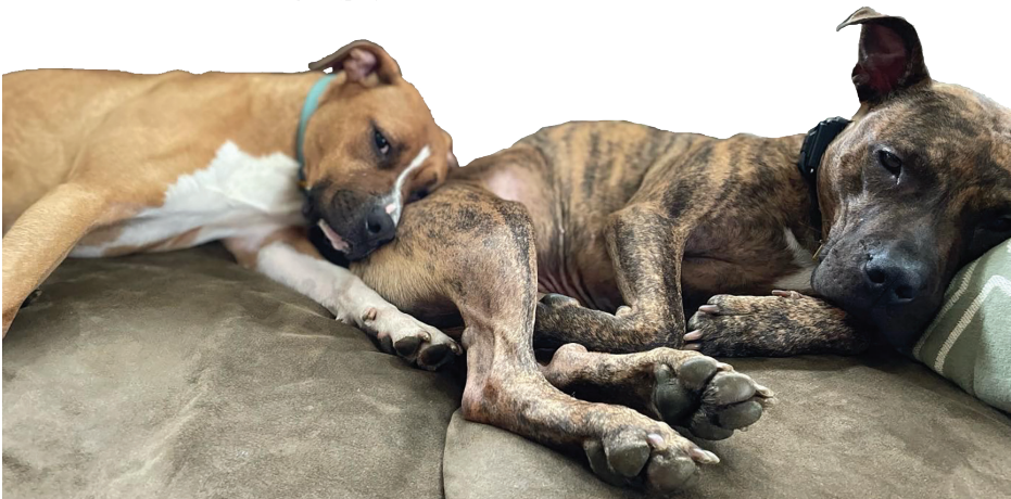
Ellie (left) loves snuggling with Madi