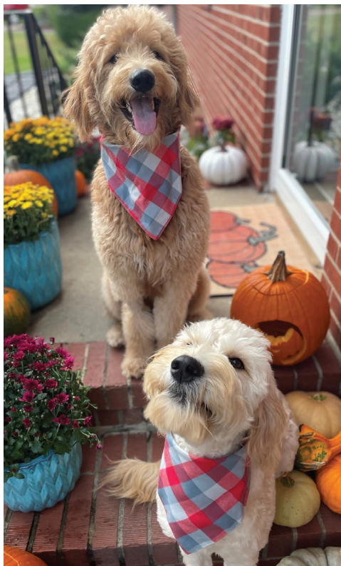
Ellie (right) and Finn smile for the camera