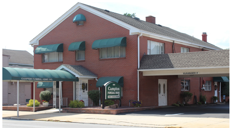
Campton Funeral Home, Inc.