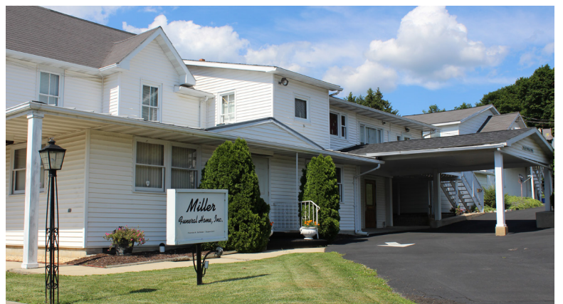
Miller Funeral Home, Inc.