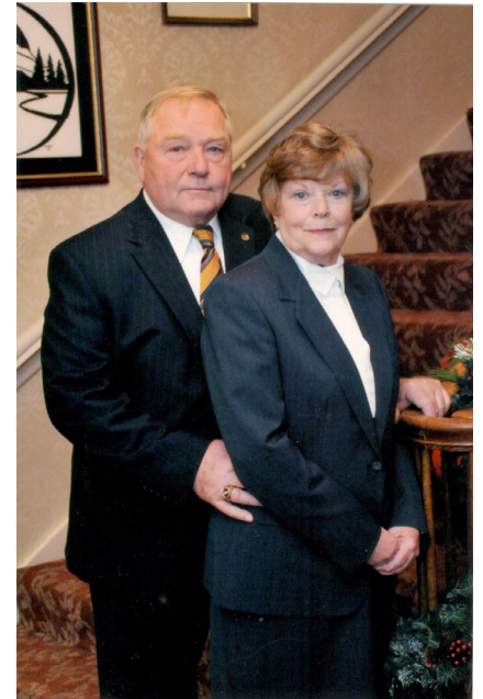
Schisler Funeral Home, Inc.