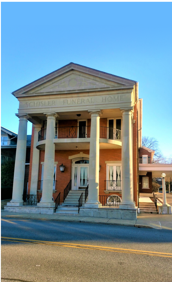
Schisler Funeral Home, Inc.