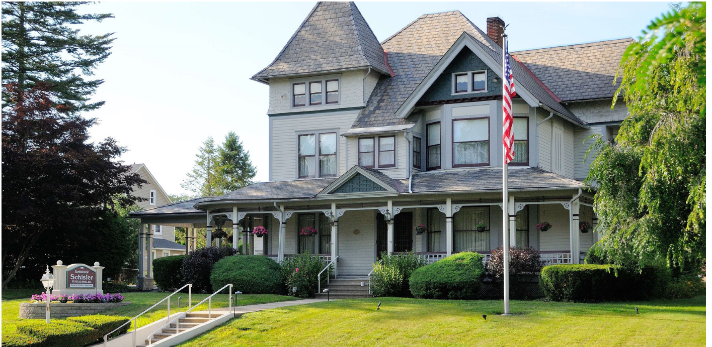
Bartholomew-Schisler Funeral Home, Inc.