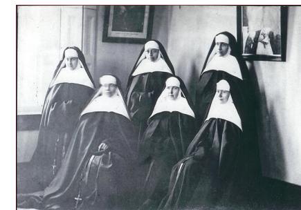
An original photograph of the six Ursuline Sisters who bravely ventured to Montana to start mission schools for Native American girls.