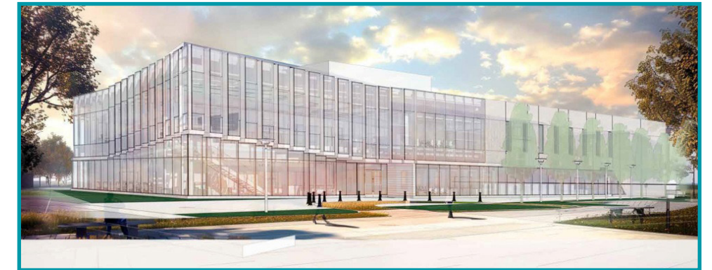
Architect rendering of the Women Religious Archives Collaborative Heritage Center, scheduled to open sometime in 2026-2027.

Letters from Sisters, beautifully hand-written, share the pain and suffering of the early days when they had so little to begin with, as well as the times of hope, joy and laughter of experiences that gave them hope and gratitude to God for being faithful and protective. Through all the trials and errors of creating new life, new