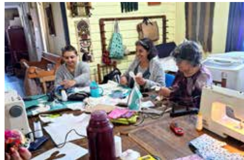
Participants enjoy attending a crafting class at Casa Ursulina in Chile in April.