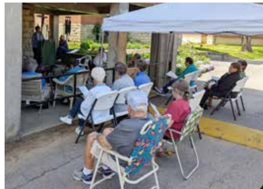
Sisters, staff and Associates at the prayer service.