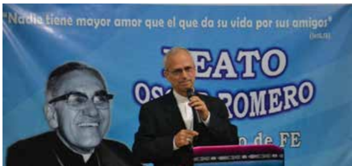
Bishop Prevost speaks at the Conference on Migration, Chiclayo Peru