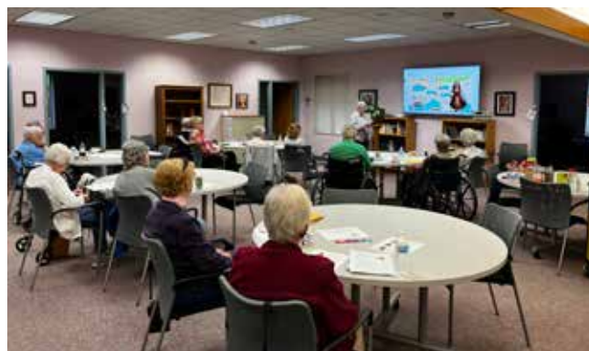
Sisters and Associates gathered to view "Jubilee Year - A Pilgrimage of Hope" video series created by the Ursulines of Louisville

Sisters and Associates gathered together in May and June to view, "Jubilee Year - A Pilgrimage of Hope with St. Angela," which was created by the Louisville Ursulines. The beautifully produced video presentation celebrates the 500 th anniversary of St. Angela's pilgrimage to Rome in 1525.