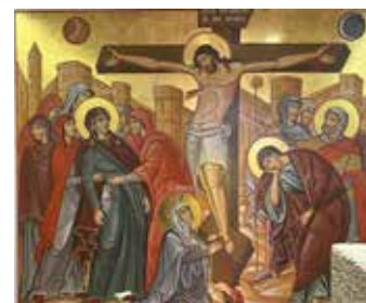
New mosaic of Angela in Italy