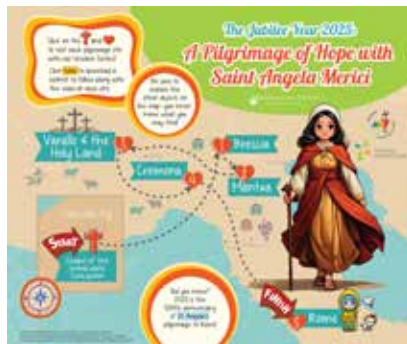
Image of the virtual map from our website.

Year, "Pilgrims of Hope." An anime version of young St. Angela was created for the map, and the Vatican's Jubilee mascot, Luce and friends also appear. Our interactive map brings St. Angela's journey to life with videos narrated by Louisville Ursuline