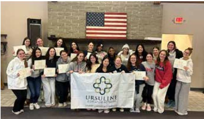
Student Leadership Conference 2025 "Be as Ministers and Servants"

A whirlwind of a year has just concluded for member schools of the Ursuline Education Network. Since January, we have celebrated both servant leadership and athletic leadership through annual Student Awards . February brought together twenty-four student leaders from around the US to Higher Ground Conference Center in western Indiana for the biennial Student Leadership Conference . March drew forty students and teachers to the United Nations for the Commission on the Status of Women Conference . Each time our students gather, or are celebrated, the spirit of insieme grows.