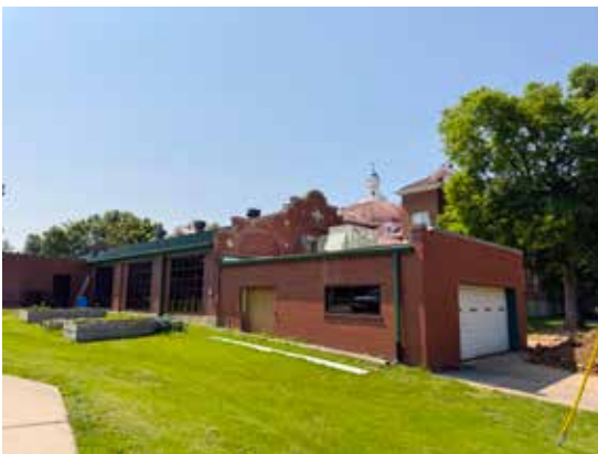
Outside of STEM building - renovations to date

The Sacred Heart Model School and Sacred Heart Academy students will benefit greatly from the