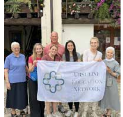
The five St. Ursula Villa pilgrims stand in front of Angela’s home at Le Grezze. A Sister from Poland and one from England joined the group for the photo. [Left and Right respectively]

In addition to the pilgrims from the Villa, two staff members from Cincinnati’s St. Ursula Academy shared in the experience.