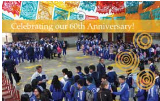
Students and staff at Santa Angela Merici School in Callao, Peru

Most importantly, throughout our reflections is a deep appreciation for the Ursuline Sisters. Each teacher feels a special connection with the Ursulines and Angela's charism, which is reflected in our activities, studies, and programming.