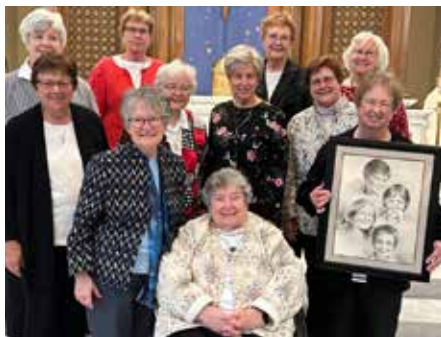
Sisters at COAR Benefit

The Ursuline Sisters are a deep part of the Salvadoran story. Fourteen Ursuline Sisters have served on the Cleveland Latin American Mission Team since 1968. Sister Dorothy Kazel