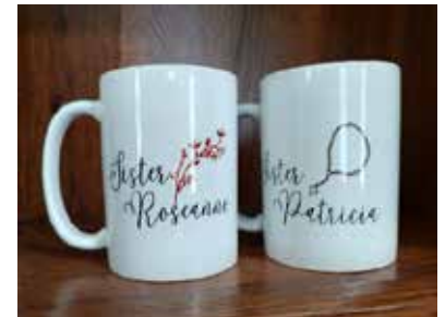
Personalized mugs created by the Ursuline Engineering students