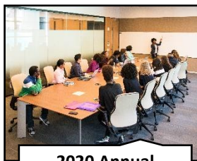
2020 Annual Meeting