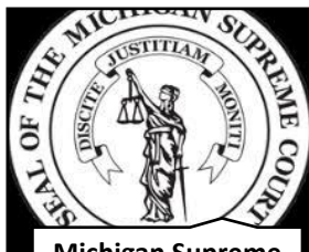
Michigan Supreme Court & CDC