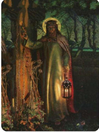
William Holman Hunt 'Light of The World'

Monday 2nd February 7.30pm St Peter's Church,