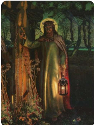
William Holman Hunt 'Light of The World'

Monday 2nd February 7.30pm St Peter's Church,