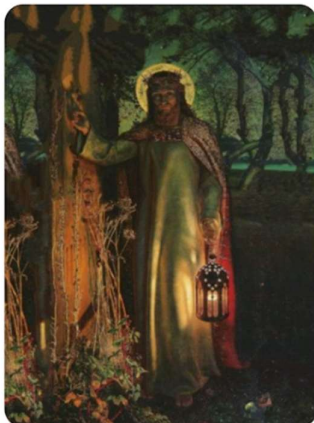
William Holman Hunt 'Light of The World'

Monday 2nd February 7.30pm St Peter's Church,