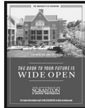
Quarter page vertical (3.75" x 5")