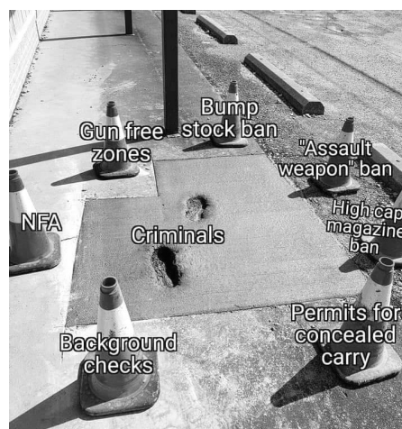
The effects of laws on criminals.