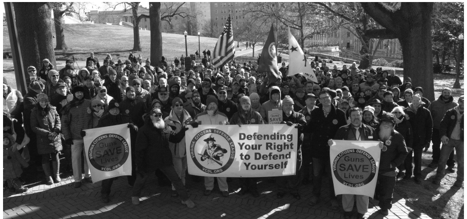
VCDL Members take a few more minutes in the frigid weather to pose for a group photo and tell others “GUNS SAVE LIVES”