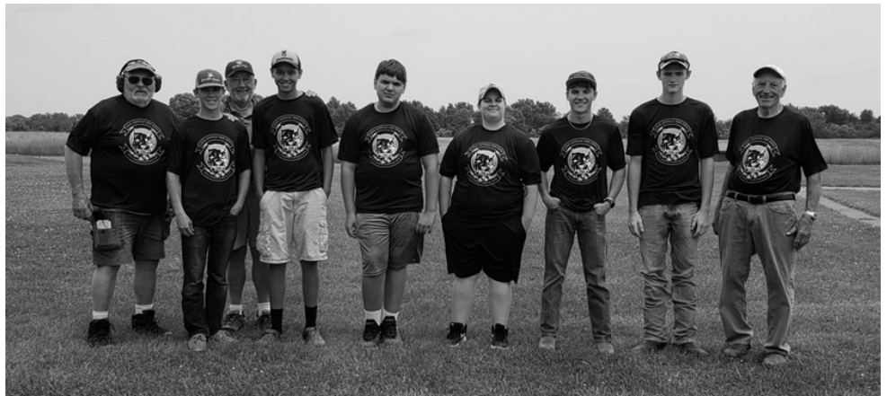
Northern Virginia Gun Club Youth Shotgun Team members

The VYTL is an 8-week program consisting of shooting 50 ATA-registered 16-yard targets per week, for a season total of 40 targets. Each shooter's scores are compared weekly to other youth's scores throughout Virginia for benchmarking purposes and progress toward end-of-season awards. Shooters are classified as Pre-Sub Jr. (ages 11 & under), Sub Jr. (12-14), Junior (15-17), and Junior Gold (18-22). The 2019 VYTL Program had 82 shooters from Virginia. NVGC VYTL