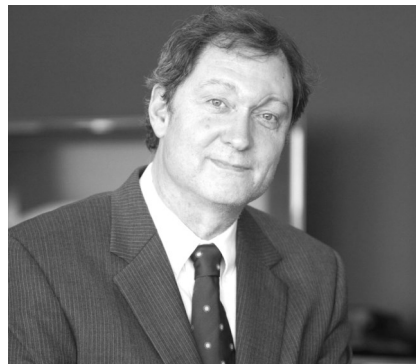
Dr. John Lott, Jr.

Doctor John R. Lott, Jr., an economist and political commentator whose research has shown that more guns equate to less crime, provided some eye-opening information on what data shows — that gun control disproportionately harms the disaffected, including women and minorities. Dr. Lott's books