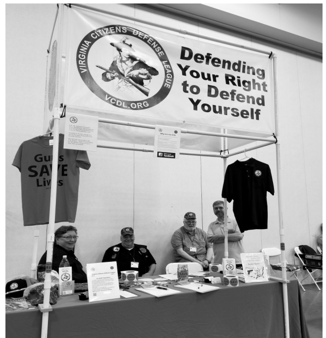
Doswell, Virginia February 25,