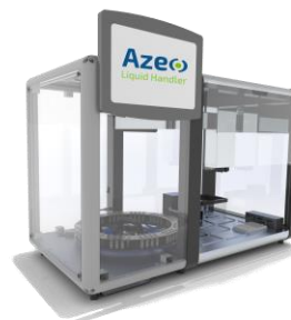
Figure 3 - Automated extraction system