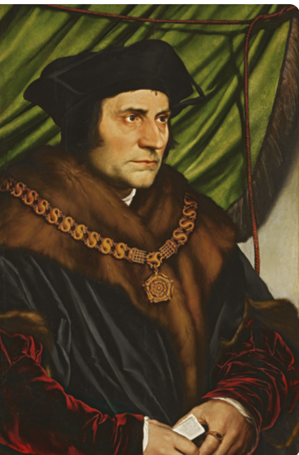
Sir Thomas More by Hans Holbein the Younger