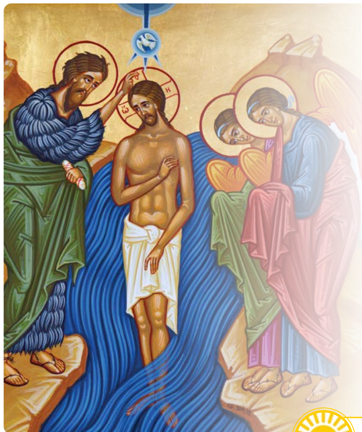
Baptism of Christ. Chapel of the Convent of the Holy Trinity in Lomnica. Vranov, Slovakia.

18-25 January: Octave of Prayer for Christian Unity