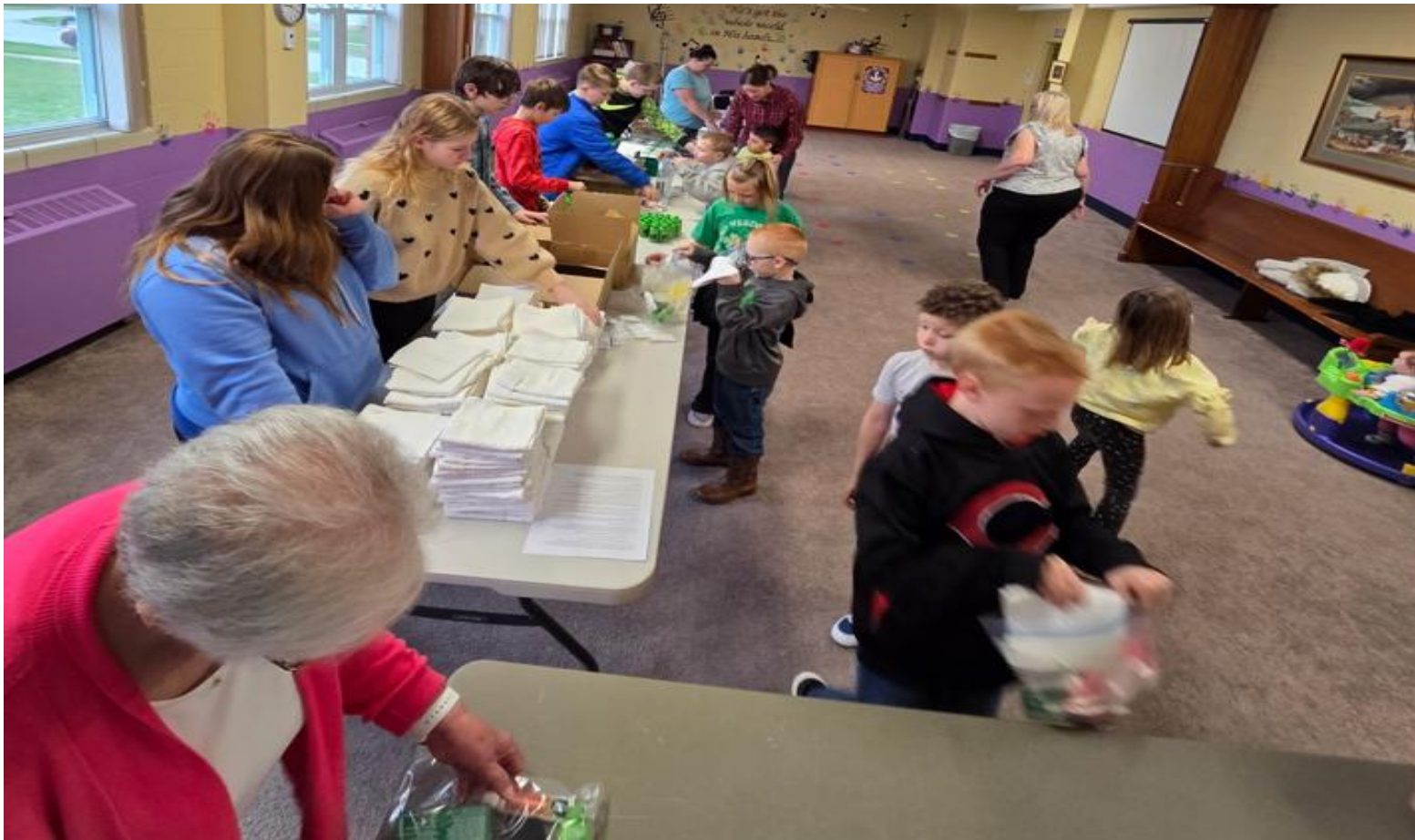
Sunday School Children assemble 200 Health Kits on March 15th, 2026