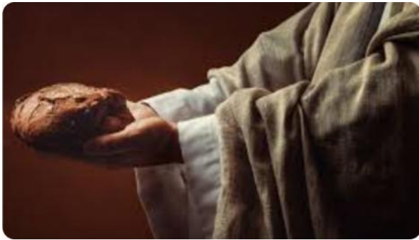
Breaking Bread Community Meal

Want to contribute to help with costs for the weekly community dinner? Donations will be gratefully accepted. Donations can be placed in the Sunday offering plate or mailed to the church office. Please be sure to indicate your name on the envelope if you would like to receive credit on your giving statement. Contributions of #10 canned food are also accepted. If you so desire, you can use this QR Code to go directly to the VANCO site to donate.