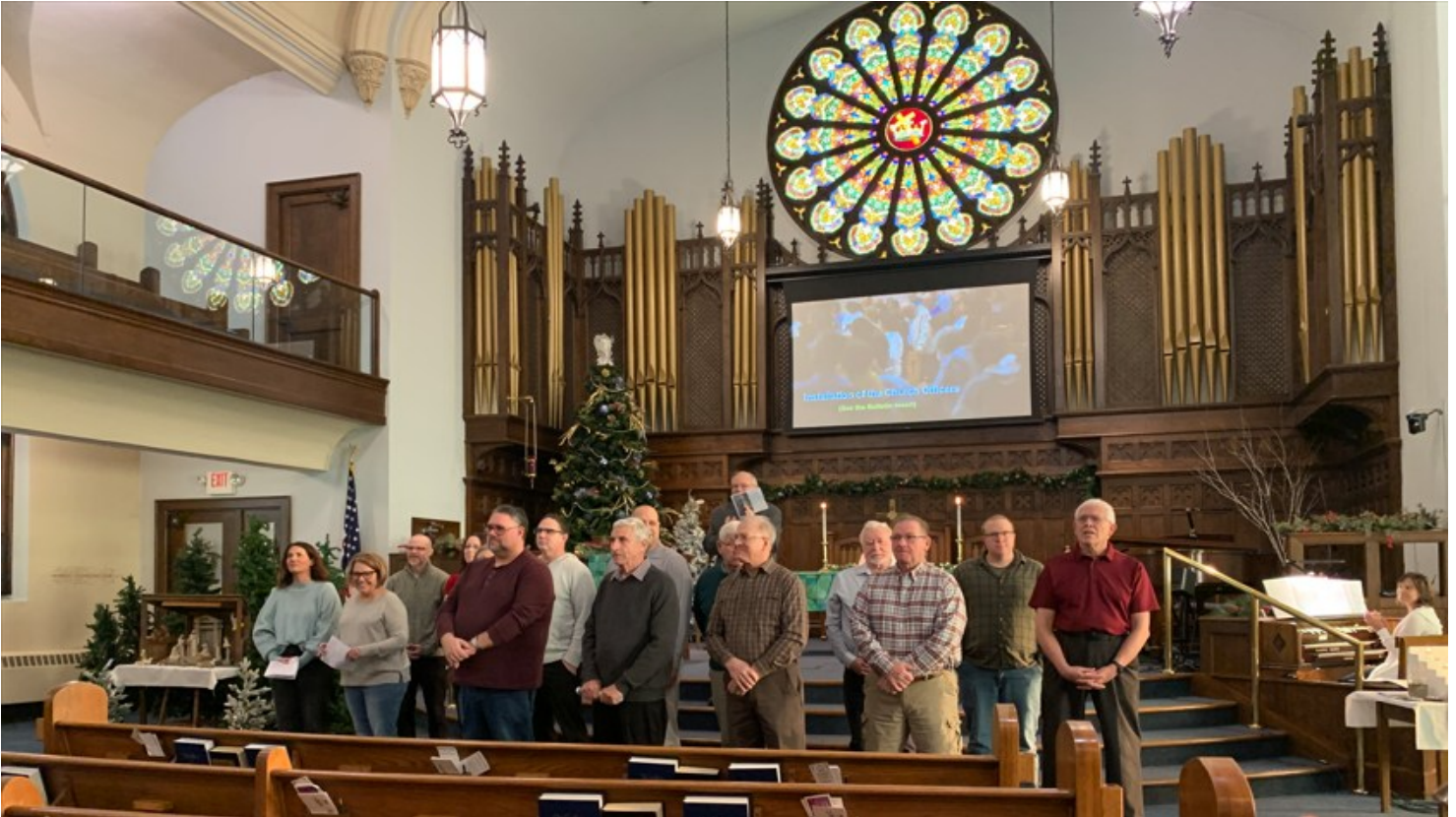
On January 11th the new Consistory members were installed. Pictured here are the new members along with some of the members returning for 2026.