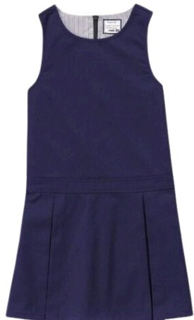
K-4 grade only