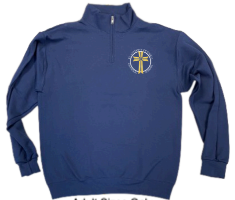
Adult Sizes Only