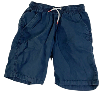
K-4 grade only Drawstring