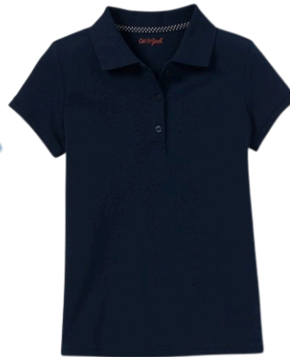
5-8 grade only