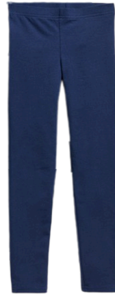
Worn under skirts or jumpers