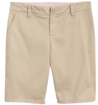
5-8 grade only