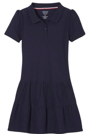
K-4 grade only