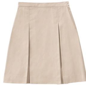
5-8 grade only