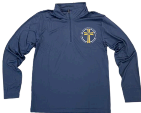
Youth & Adult Sizes