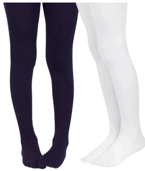
Worn under skirts or jumpers