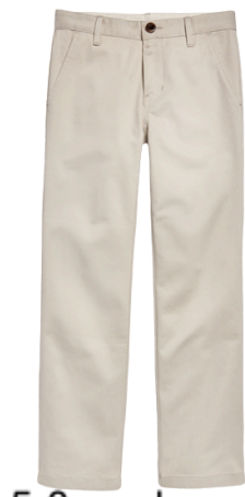
5-8 grade only