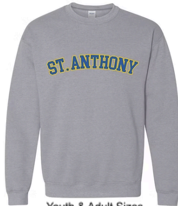
Youth & Adult Sizes