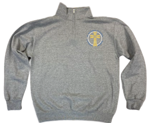
Adult Sizes Only