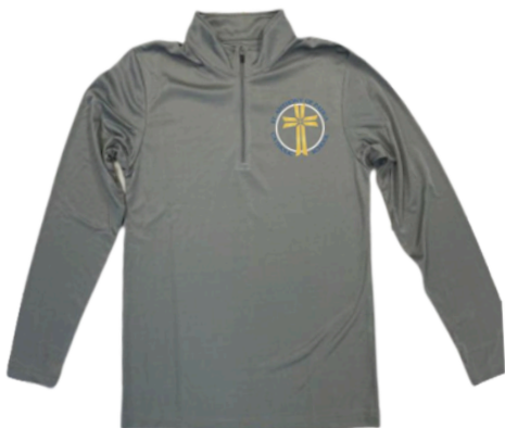
Youth & Adult Sizes