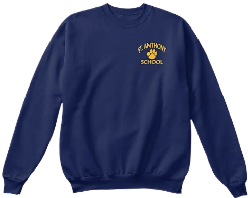
Youth & Adult Sizes