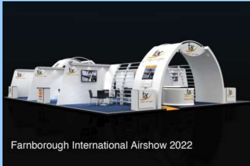
Farnborough International Airshow 2022