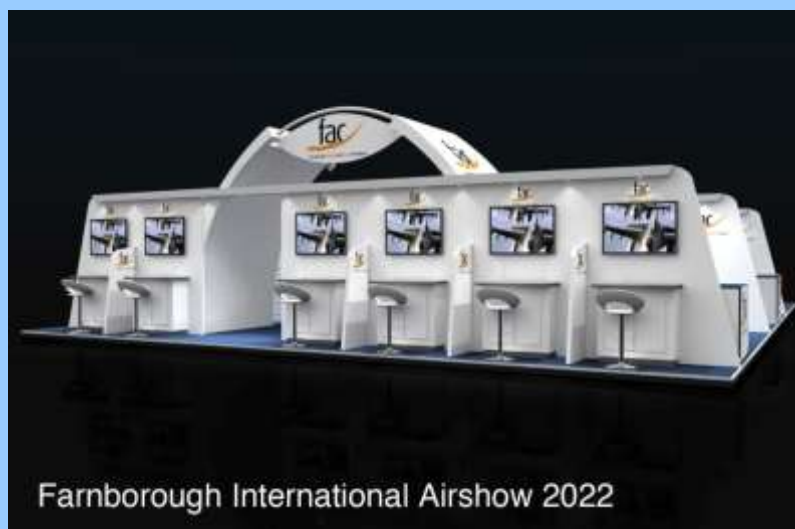
Farnborough International Airshow 2022