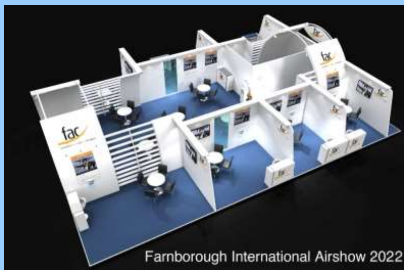
Farnborough International Airshow 2022