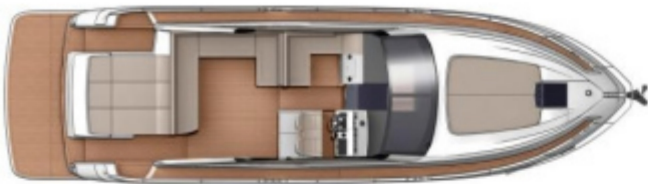
Lower Deck 3 Cabin