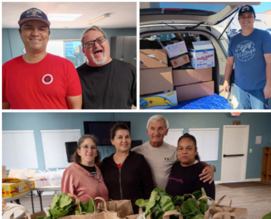
MAY 2026 North Coastal Agency Spotlight: Grace Presbyterian Church

This month, we're highlighting Grace Presbyterian Church, a dedicated agency rooted in the Vista community that recently celebrated 10 years of partnership with Feeding San Diego. They organize a twice-weekly walk-up distribution, offering a bounty of fresh produce and nutritious foods to the public. They are also one of the few agencies in the area that offer non-food items, such as pet food, cleaning products, and over-the-counter medication.