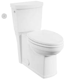
Estate® Touchless Toilet 6