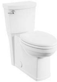
Estate® Skirted Toilet 7