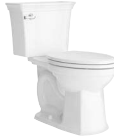
Estate VorMax® 8