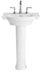
Pedestal Sinks 4