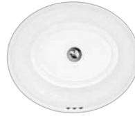
Under Counter Sinks 5