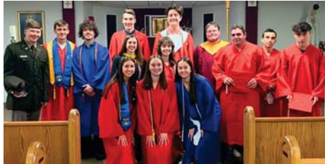
Last year's graduates