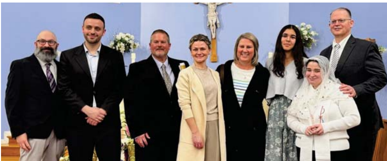
Newly Baptized and Confirmed, and their sponsors