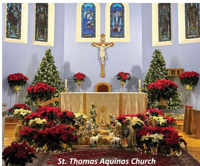
St. Thomas Aquinas Church