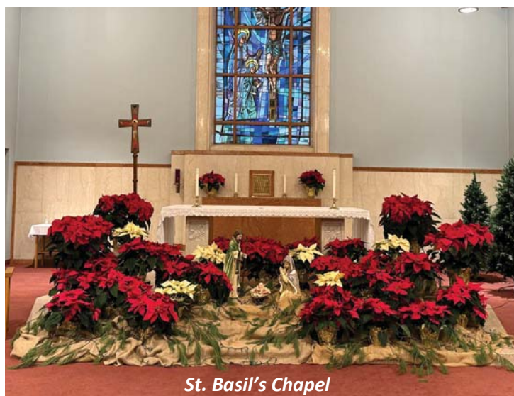
St. Basil's Chapel