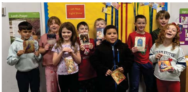
Our grade 1-7 students and the crafts they made for our homebound parishioners