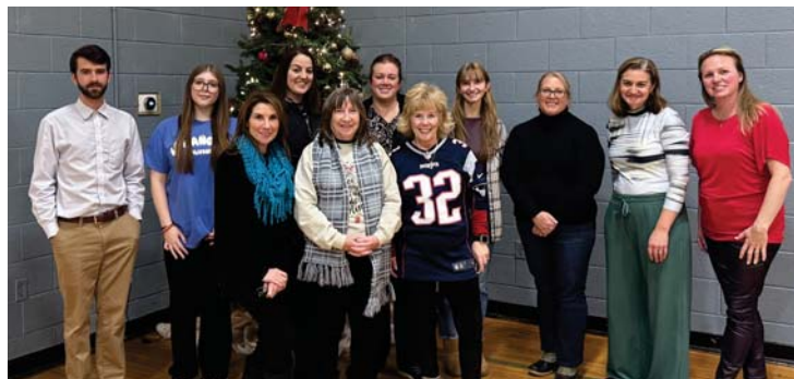
Our Confirmation Program volunteers