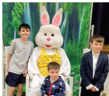
Easter Egg Hunt