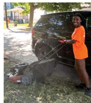
Our High School students and adult chaperones participating in a Catholic Heart Workcamp Mission Trip to Niagara, NY