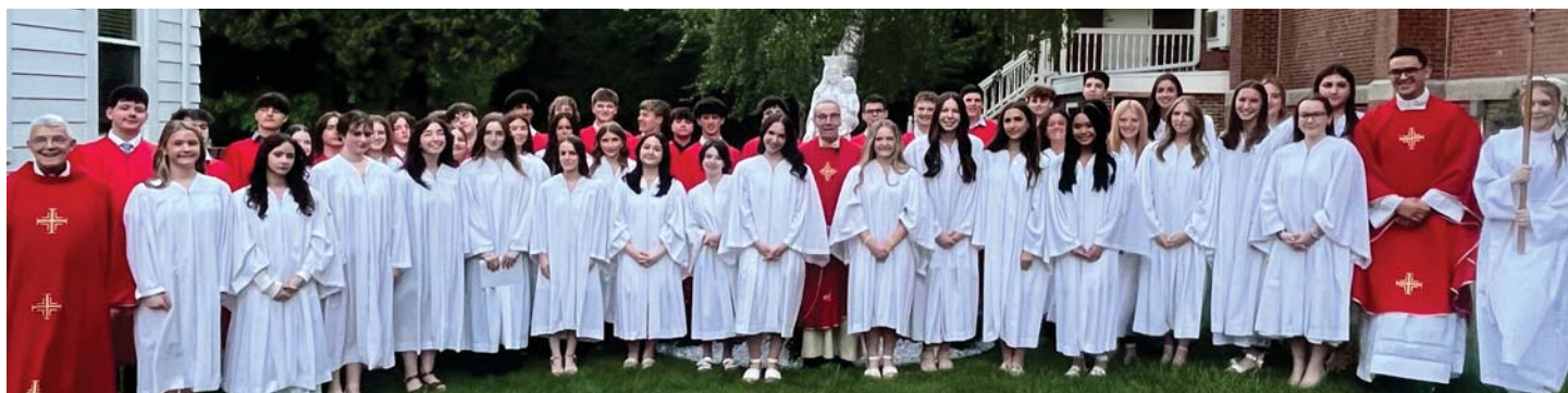
Confirmation Class 2025