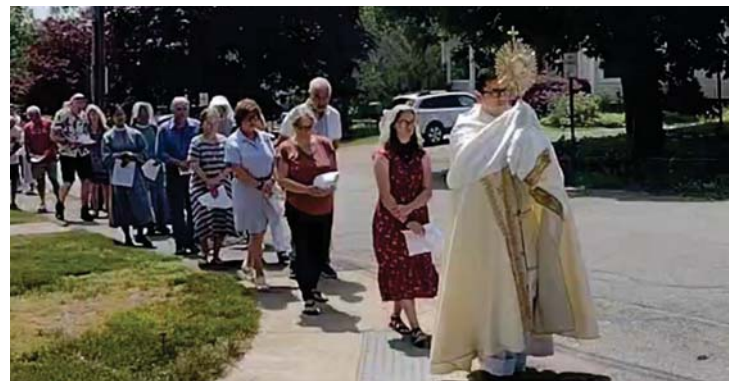
Corpus Christi Eucharistic Procession