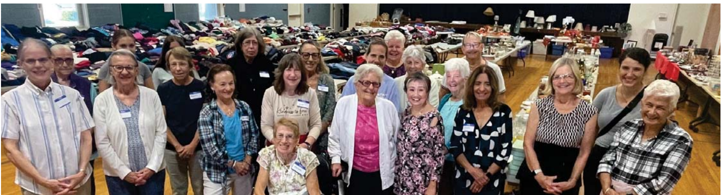
Volunteer team for our annual Rummage Sale