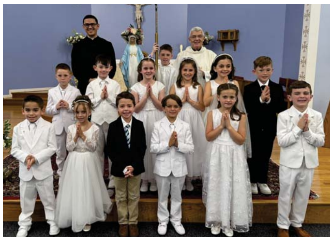
One of our 4 First Communion classes