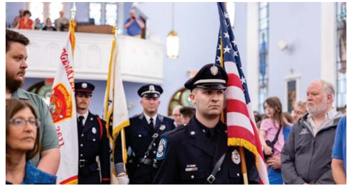
Our First Annual Public Safety Mass