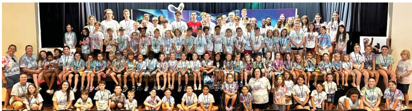
Vacation Bible Camp campers and volunteers