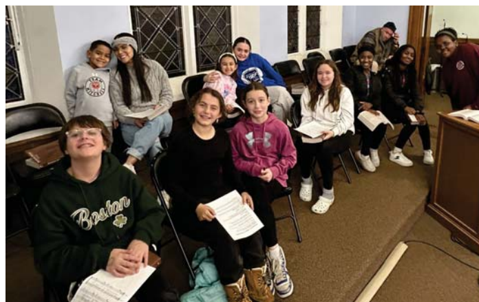
Our amazing adult and youth choirs