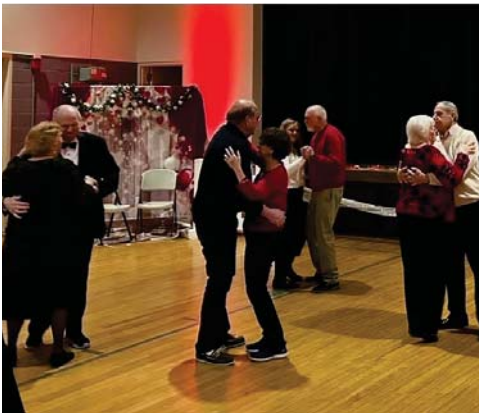
St. Valentine's Dinner Dance

As we reflect back on this past year, the following photos depict its highlights. We hope that you and your family will join us as we celebrate our faith and our community! For additional photos of our dynamic, faith-filled parish, please visit our website at www.stthomasaquinas.com and our Facebook page, Saint Thomas Aquinas, Bridgewater, Massachusetts.