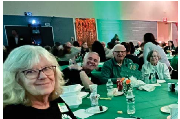
Volunteer Appreciation Social