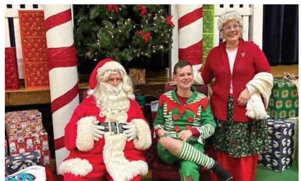
Knights of Columbus Very Special Christmas Party