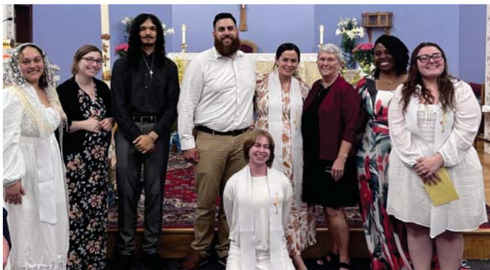
Newly Baptized and Confirmed - Easter Vigil