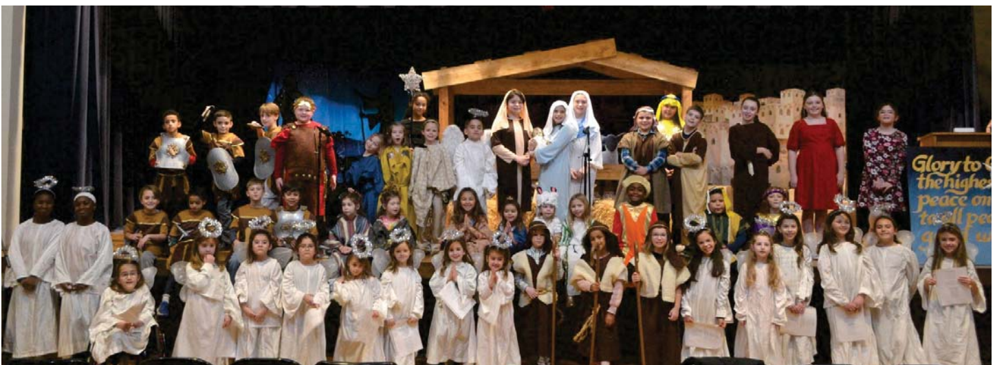
Annual Christmas Pageant