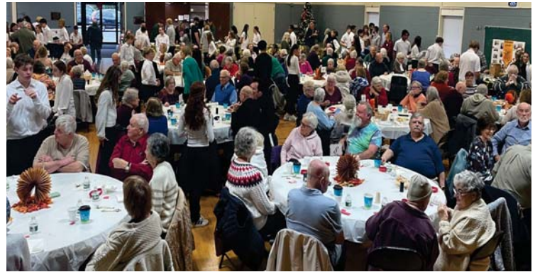
Senior Citizen Thanksgiving Dinner - attendees and volunteers