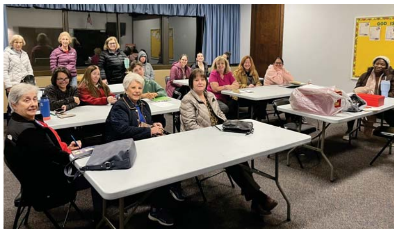
Our Giving Tree Ministry volunteers