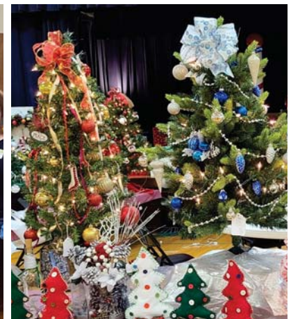
Annual Christmas Bazaar Volunteer team and handmade items