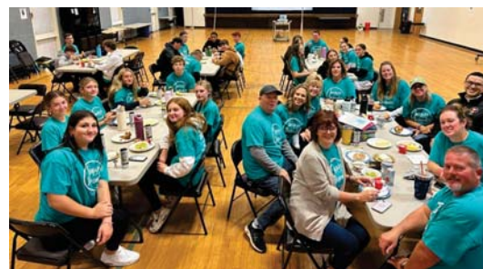
Our First Inspire Bridgewater Local Mission Service Day