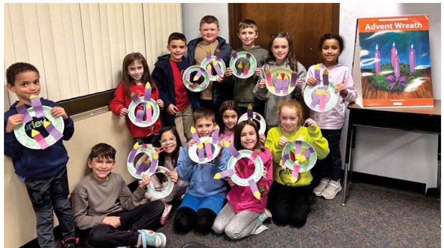
Grade 2 students in Mrs. Burns' class are preparing for Christmas with their Advent wreaths. Many thanks to the enthusiastic Confirmation students who helped in the classrooms!

CONFIRMATION Classes – Next in-person dates: December 7 AND 14