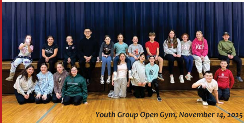
Youth Group Open Gym, November 14, 2025