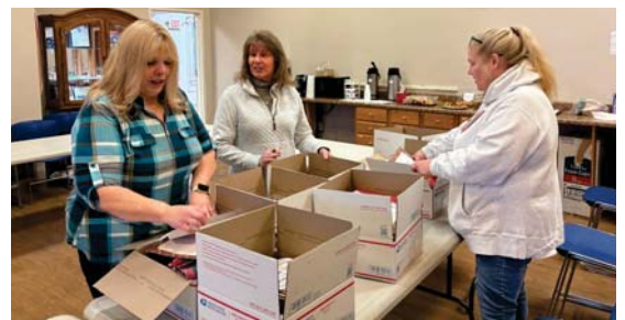
Volunteers packing items to send to troops