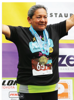
Age Division Winner