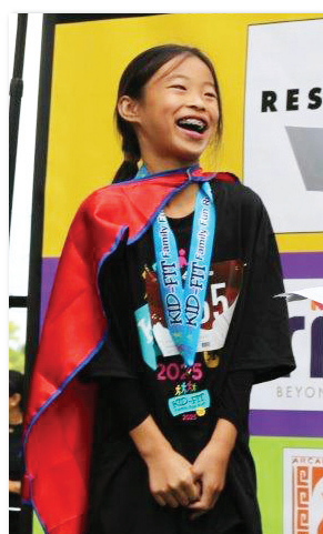
Youth Age Division Winner