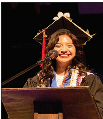
A senior in the Commercial Dance Conservatory gives a commencement address to the graduating class of 2025.

While attending CSArts-SGV, many of these impressive seniors were honored with various accolades