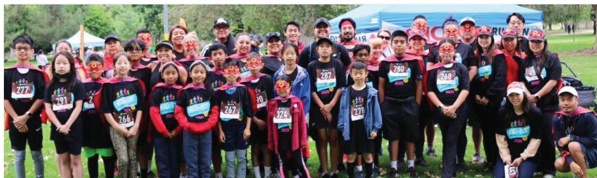
Encinita Running Club