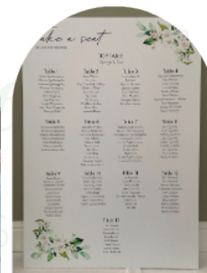
Table plan (A1 size)