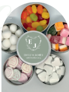
Personalised sweet tins (sweets included)