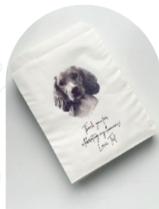
Printed sweet bags with pet photo