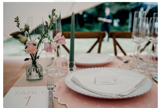
Place cards and table numbers