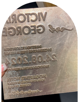
Custom magnesium plate for (deboss) foil pressing

Postage/shipping is charged in addition according to Royal Mail current tariff.