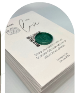
QR code cards for guest photo uploads