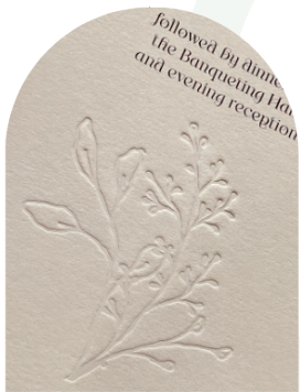
Essential foil stamping combined with digital print

All foil stamping print packages are subject to a minimum order of 25 and include all design work with up to 3 rounds of revisions and the manufacture of the magnesium plate for pressing (either for embossing or debossing as required).