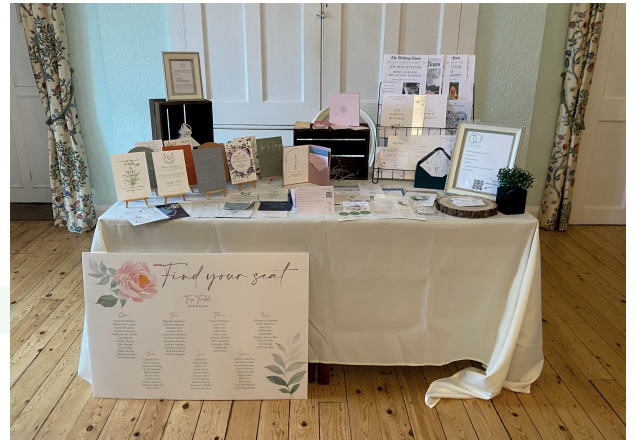
Choice of card colours