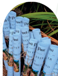
Wedding newspapers with your custom design sections