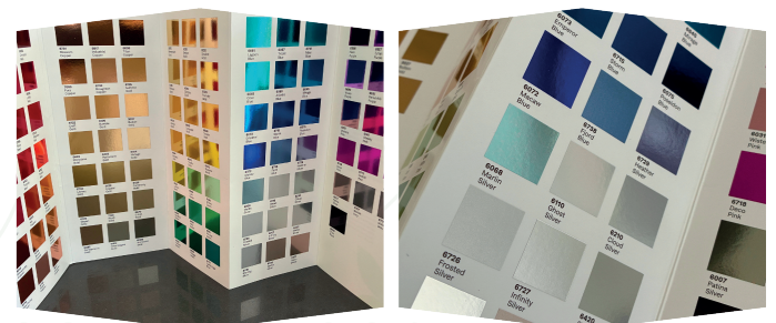
A small selection of the many metallic foils available