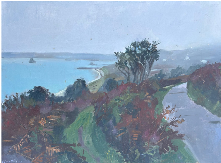
St Martins, Scilly Isles Oil on board 12 x 16 inches £1,250