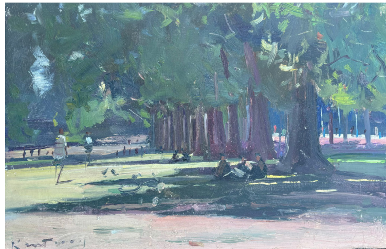
Summer, Green Park

Overleaf Hay Bales Oil on board, 12 x 16 inches, £1,250