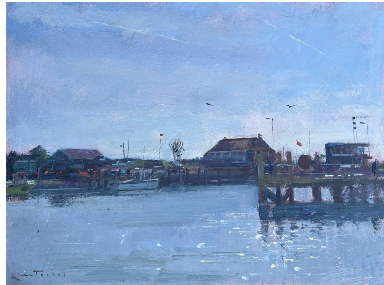
Rye Harbour Oil on board 12 x 16 inches £1,250