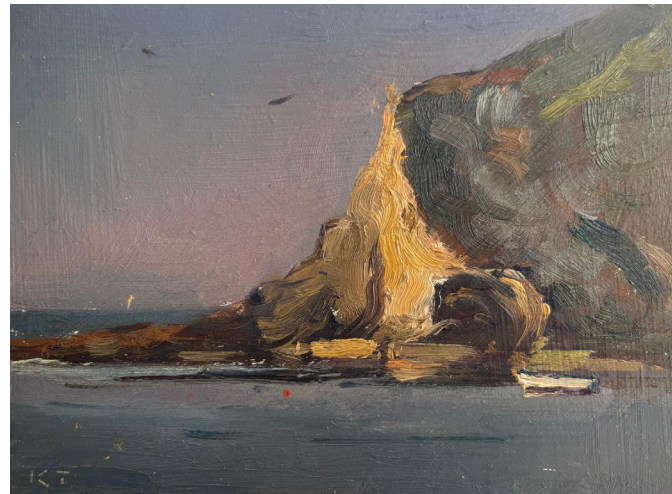
Lulworth Cove Oil on board 6 x 8 inches £750