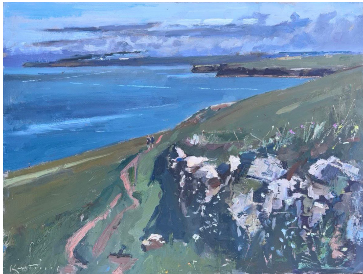
The Rumps, Polzeath Oil on board 12 x 16 inches £1,250