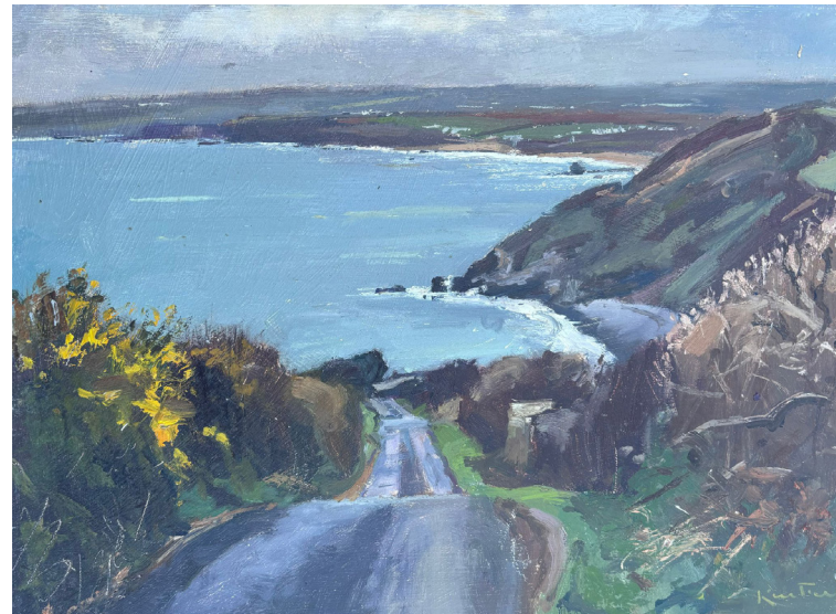
Cornish Lane Oil on board 12 x 16 inches £1,250