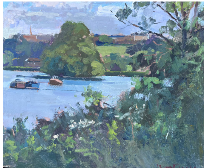
Richmond on Thames Oil on board 12 x 16 inches £1,250