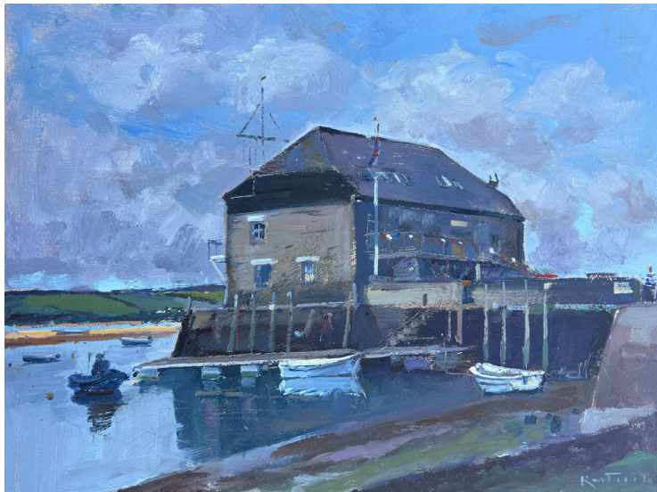
The Yacht Club, Rock Oil on board 12 x 16 inches £1,250