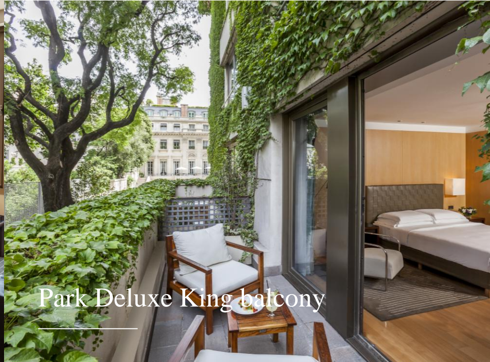
Park Deluxe King balcony