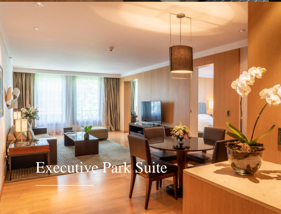
Executive Park Suite