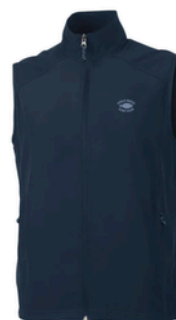
Charles River Men's Pack-N-Go Vest