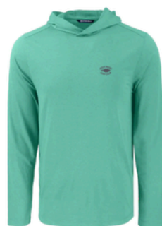
Cutter & Buck Coastline Epic Comfort Hooded Shirt