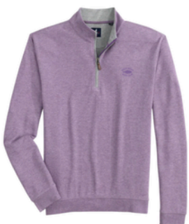
johnnie-O Sully Quarter Zip