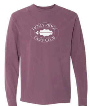
Comfort Colors Garment-Dyed Heavyweight Long Sleeve