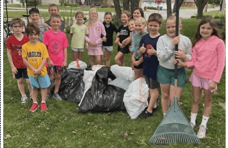
3 rd grade PSR students picked up tree branches etc from a neighbor's yard. Service, kindness, and friendship in action!